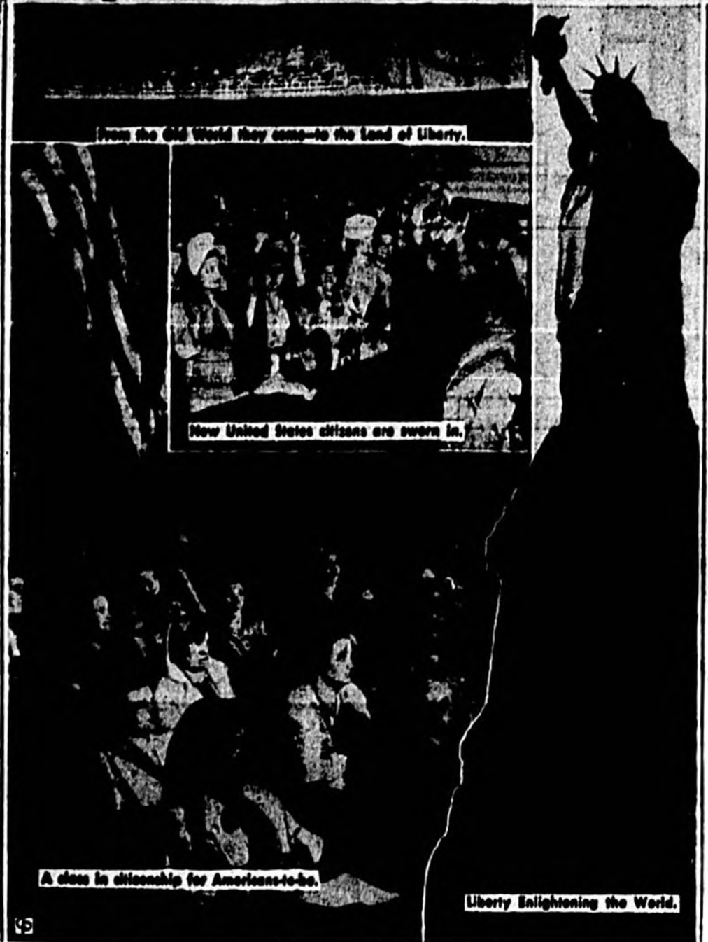
"GIVE ME your tired, your poor, your huddled masses yearning to breathe free, the wretched refuse of your teeming shores"—from a poem by Emma Lazarus, graven on a tablet within the main entrance of pedestal on which the towering Statue of Liberty stands in New York harbor.