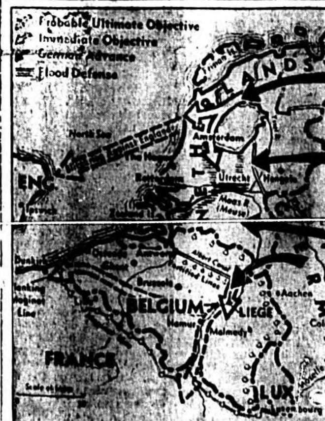
The march of Mars in Europe is shown on this map, which shows lines of advance and defense and objectives at which Germany is believed to be aiming.