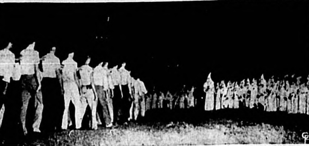
LONG LINE OF NEW MEMBERS MARCHES TO JOIN HOODED KLANSMEN DURING CEREMONY