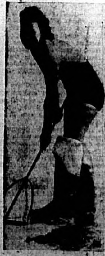
SWIFT SWEEP Miss Greenwall, 22, some days stays but in disguise at London, England, when...