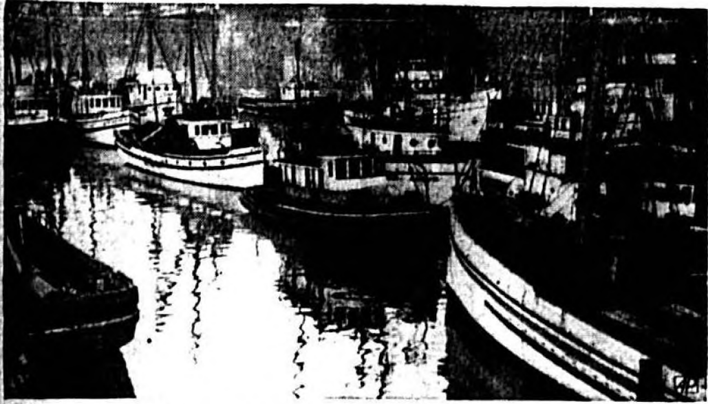
THE FLEET'S IN for some strenuous work as the halibut season off British Columbia and Alaskan coasts opened taking these fishing boats away from Seattle harbor, where they're shown. Loaded with tackle and supplies, the ships head for the "banks."