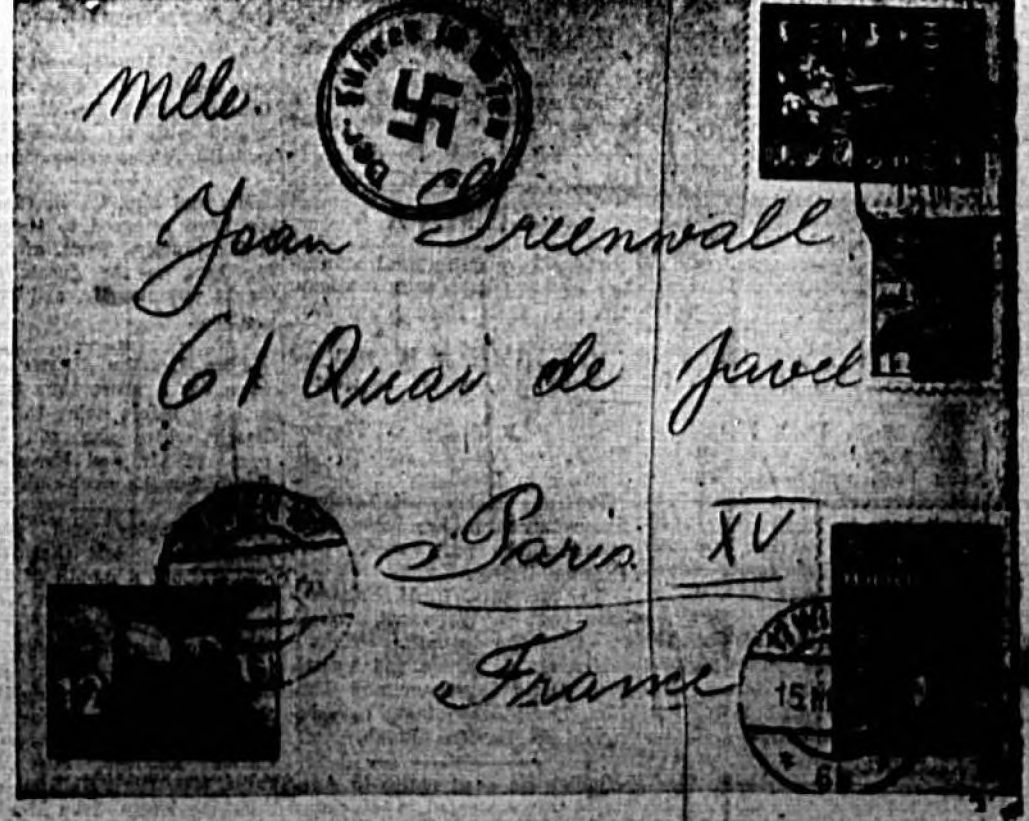
PHILATELISTS' PRIZE. this cover bearing special cancel commemorating Adolf Hitler's historic visit to Vienna, Austria, March 12 was received in Paris. Above the swastika are the words "The Landing in Vienna." The cover carried four Austrian stamps.