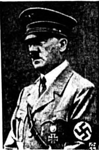
With all Europe in the grip of a crime tension of fear over the mobilization of 1,000,000 German soldiers presumably to engage in "war games" beginning next week, Adolf Hitler again is the center of attention as diplomats move feverishly in attempts to make sure Mr. Hitler's "war game" are confined to Germany.