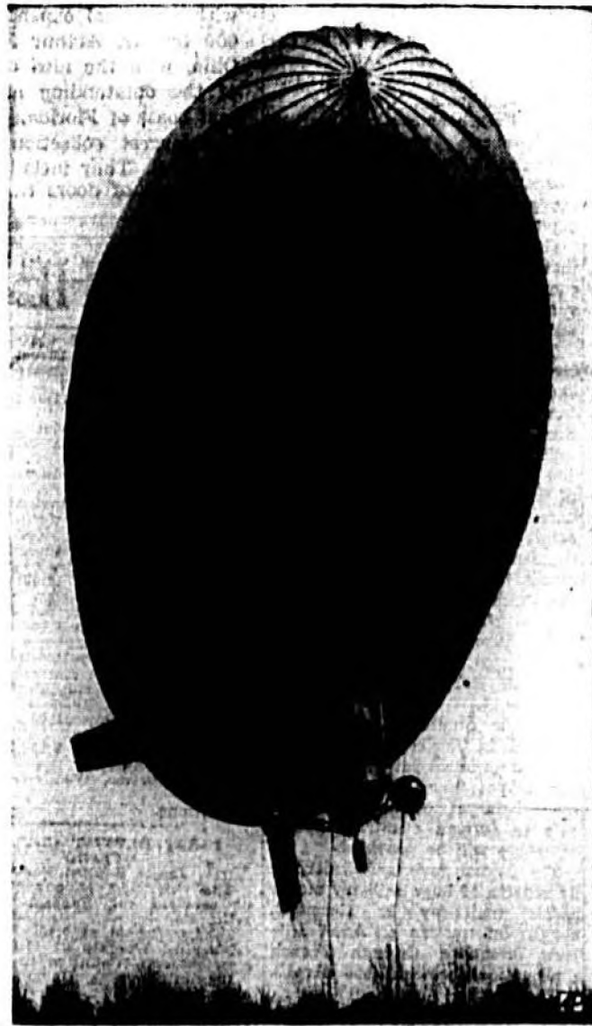
STILL FRIENDS. helium-filled blimp L-1 was launched at Akron indicating that U. S. navy hasn't wholly lost interest in lighter-than-air craft despite past disasters to dirigibles. Ship, with gas capacity of 125,000 cubic feet, is first navy dirigible built at Akron works since U. S. three years ago. She is shown pointing skyward just after leaving her mooring mast.