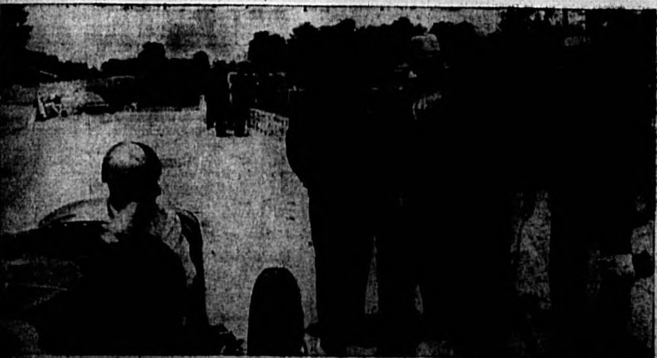
SWIFT MEMORIAL DAY RACE is expected at Indianapolis tomorrow, when official photographers have been "shooting" the drivers. The 1937 winner, Wilbur Shaw, "Wild Bill" Cummings, leads today's race in the 100-mile endurance trial.