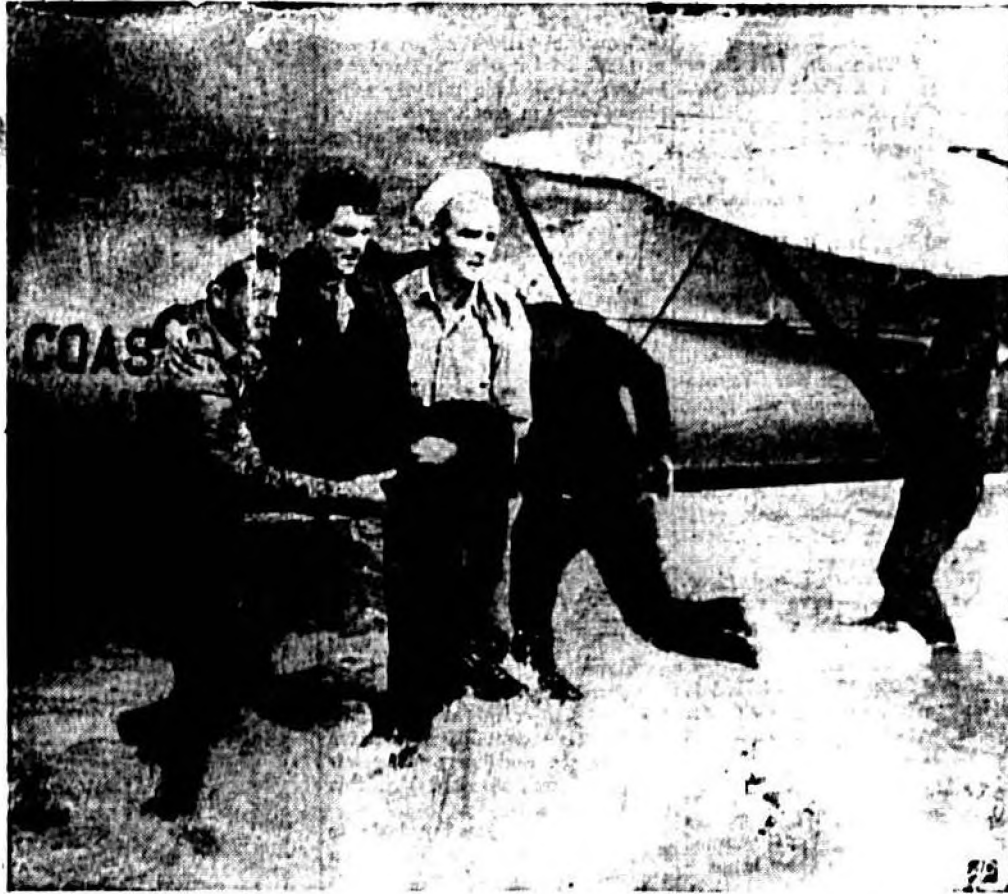
CRASH OF PLANE INTO BAY not far from Floyd Bennett field, New York, injured three of the five pilots in the monoplane and led to their rescue by coast guardsmen in an amphibian. Above, one of the five is carried ashore by the guards. The monoplane had crashed from 100 feet, and an alarm was sounded by a naval officer flying nearby, toward Bennett field.