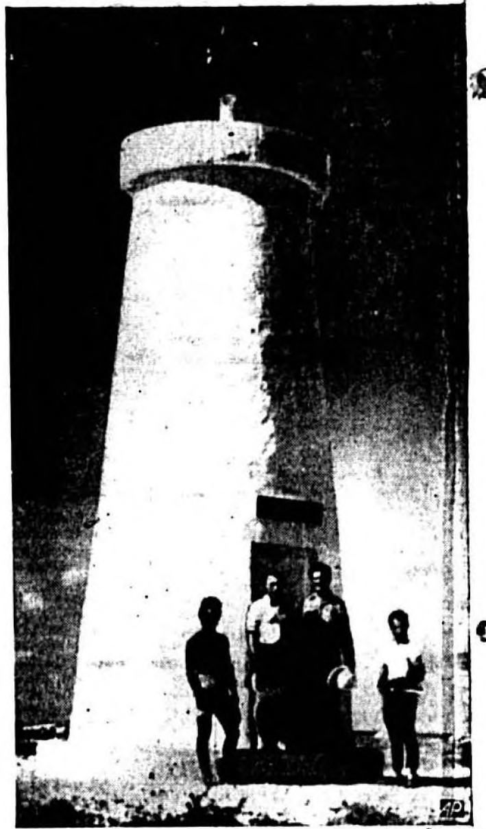
EARHART LIGHT gleams from this memorial lighthouse, erected on tiny Howland island in mid-Pacific in honor of the lost Amelia Earhart who was forced down at sea last July while flying to Hawaii from New Guinea. Colonizers from Honolulu built the light which will be turned on at request of passing ships. Miss Earhart was completing a round-the-world flight when lost at sea.