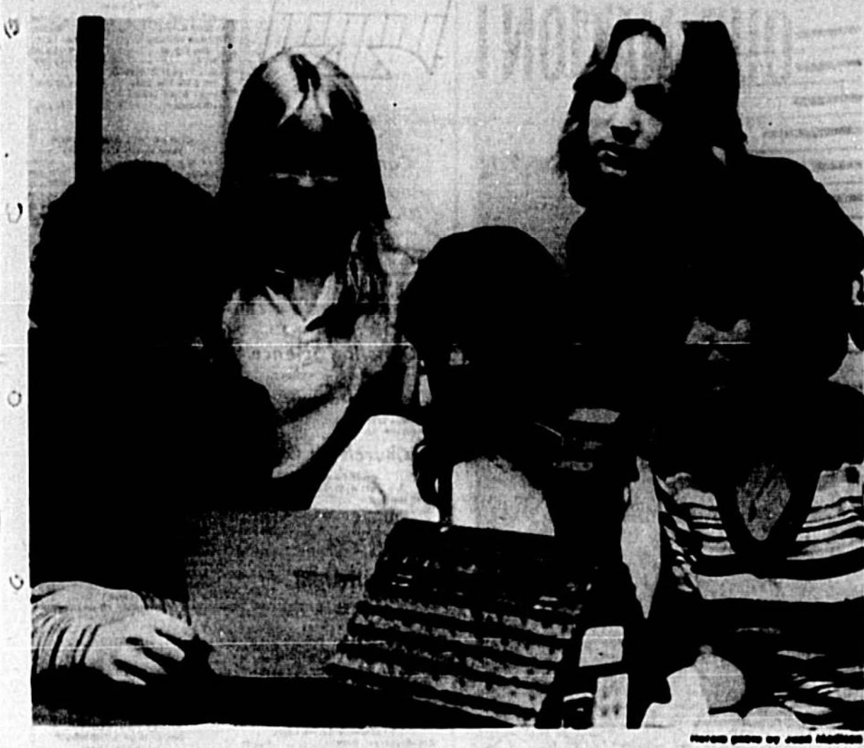
Through their volunteer school services, five girls have been instrumental in recruiting 200 Lyman students to join the staff of Seminole County school volunteers.