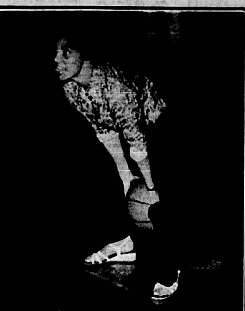
DON'T LET 'EM FOOL YA