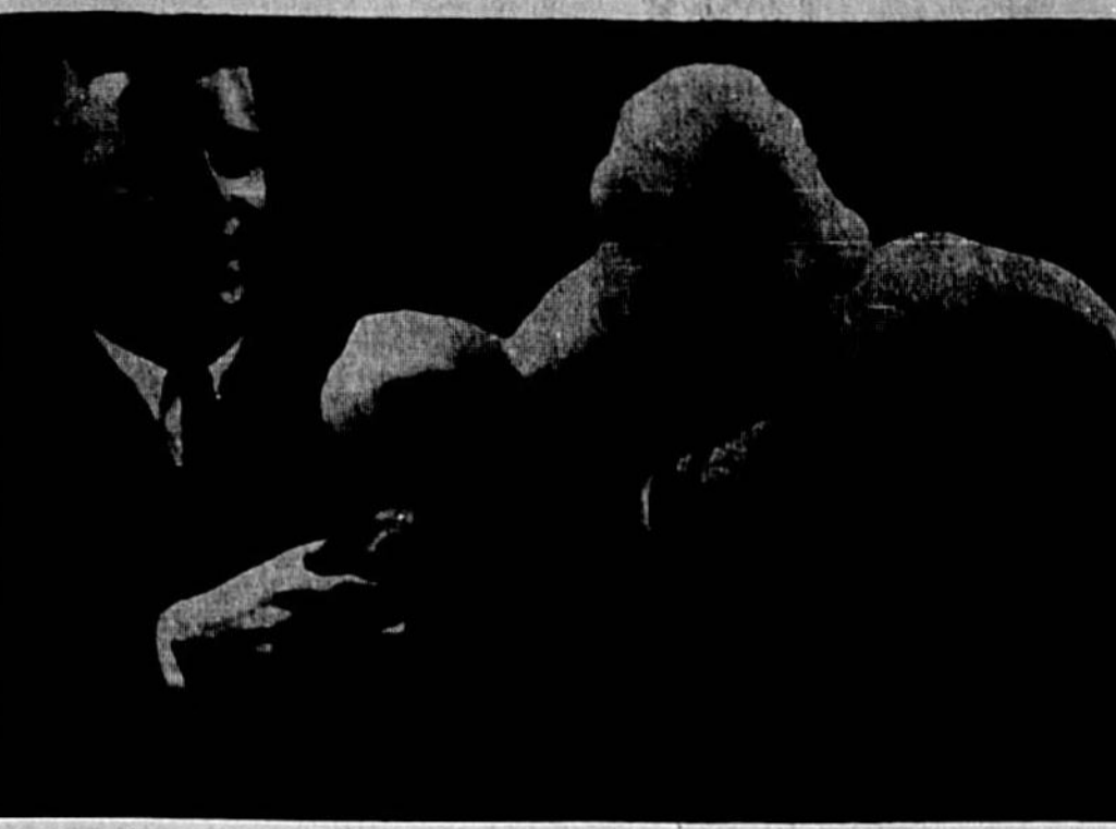
RUBBER PRODUCED in only 60 seconds—Mix two liquids in a pop bottle, shake well and in one minute a mass of synthetic rubber 18 times the volume of the bottle leaps forth—that's the tempo for one of the fascinating sequences in the 40-minute General Motors science show, Previews of Progress.

Crooms High School students will look into the future when General Motors "Previews of Progress" science show appears in the school auditorium at 10 a. m. Jan. 13.