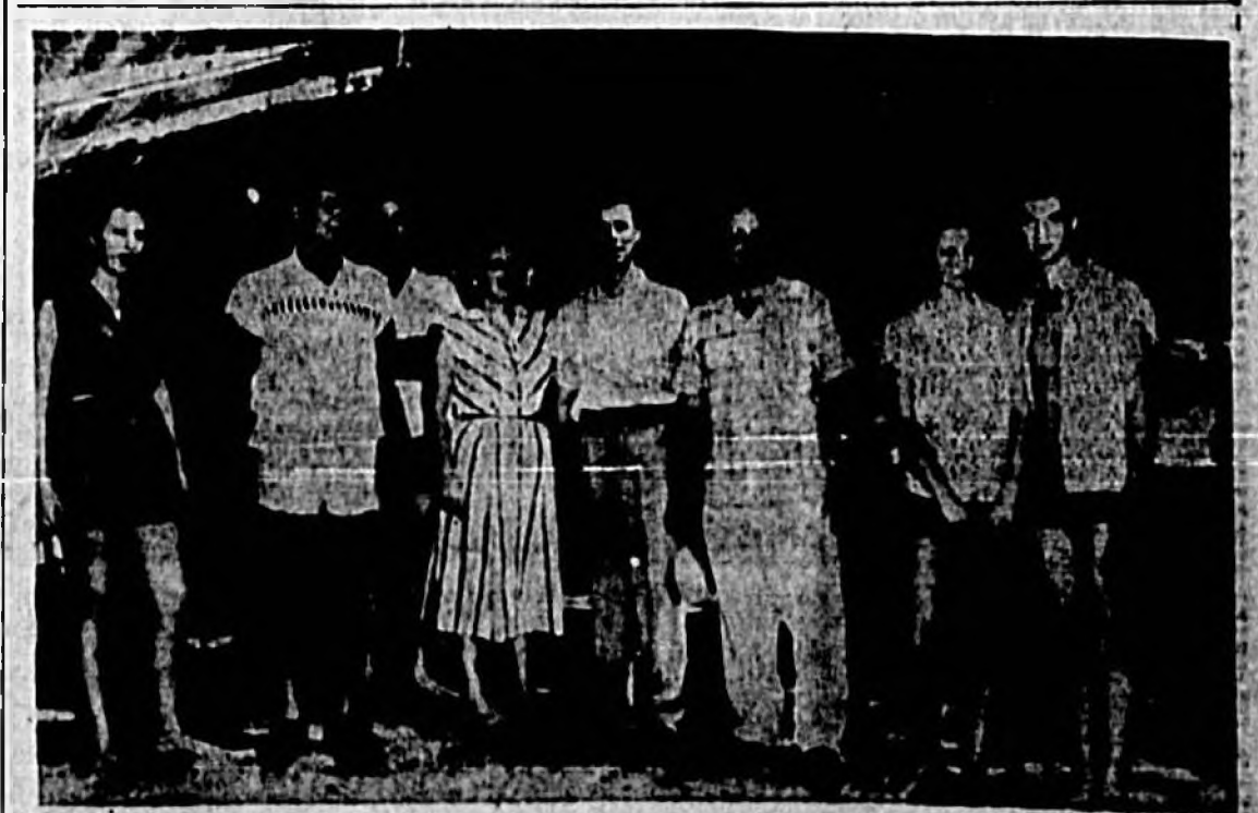
OFFICIALS OF THE TWO Sanford Winn-Dixie Stores at the 12-store annual picnic held at Seaside Springs yesterday. More than 600 employees and their families attended the affair.