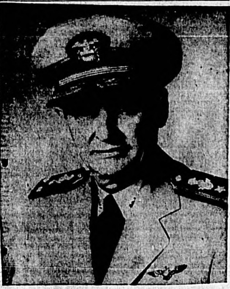
VICE ADMIRAL WILLIAM L. REES, USN, Commander Air Force, U. S. Atlantic Fleet, is scheduled to visit aboard Sanford Naval Air Station Wednesday. The Admiral will arrive by plane from the Key West Naval Station on an informal tour of the station.