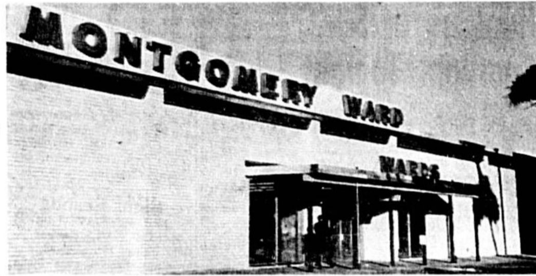
Signs are being stocked and employees are undergoing training in preparation for the store's March 1 grand opening.