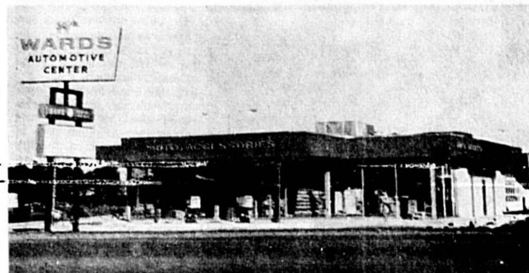
MONTGOMERY WARD'S Automotive Center and Service Station (top) is readying for the Feb. 22 opening at Seminole Plaza in Casselberry.