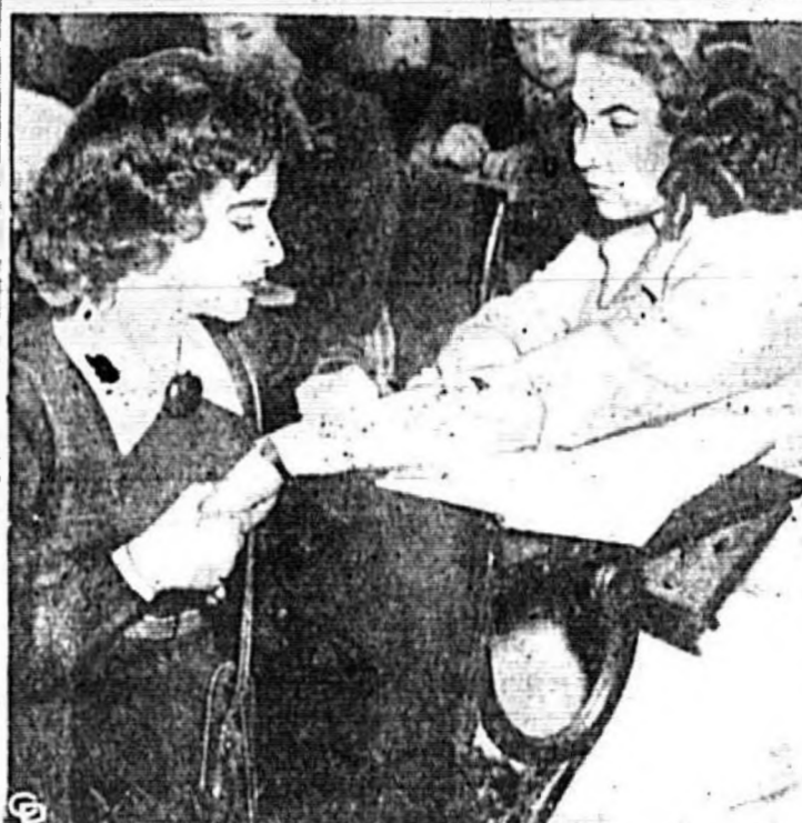
CHILDREN IN SCHOOL AT THE ...