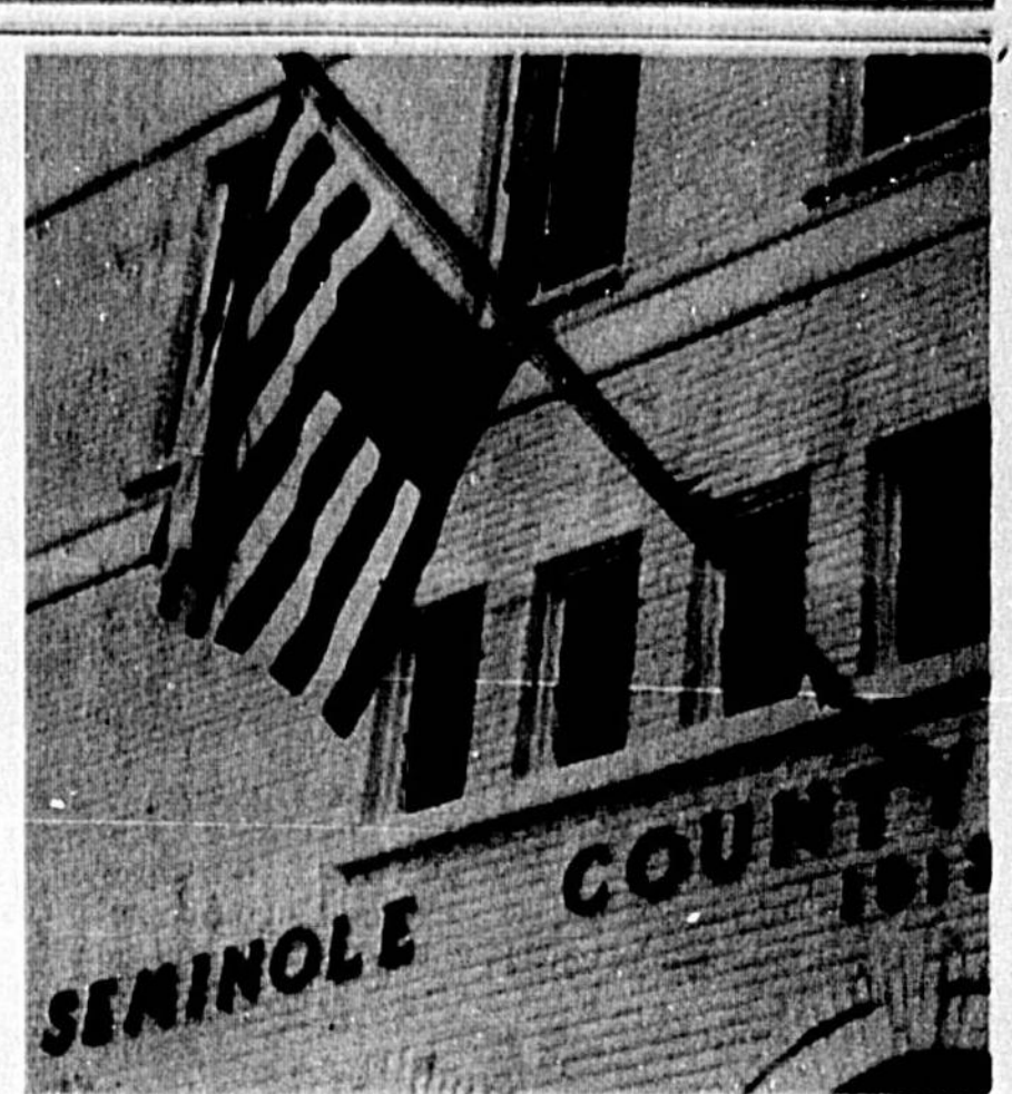
THE COURTHOUSE threw out the distress signal this morning apparently in protest of the planned new facility. Old Glory flying upside down signals an SOS.

VOL. 59 NO. 39 — AP Leased Wire — Established 1908 — THURSDAY, OCT. 13, 1966 — SANFORD, FLORIDA — Price 5 Cents