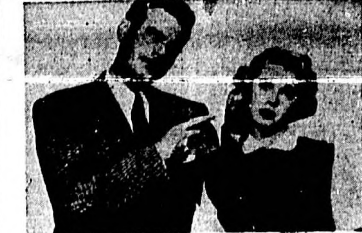
Billy DeWolfe gives Mona Freeman an ear-plugging scolding in a scene from Paramount's "Dear Brat" showing Tuesday and Wednesday on the Ritz Theater screen.

(Continued From Page One) Iranian proposal. He has been in close contact with British Ambassador Sir Francis Shepherd and is well-informed on how far Britain is willing to go toward a compromise.