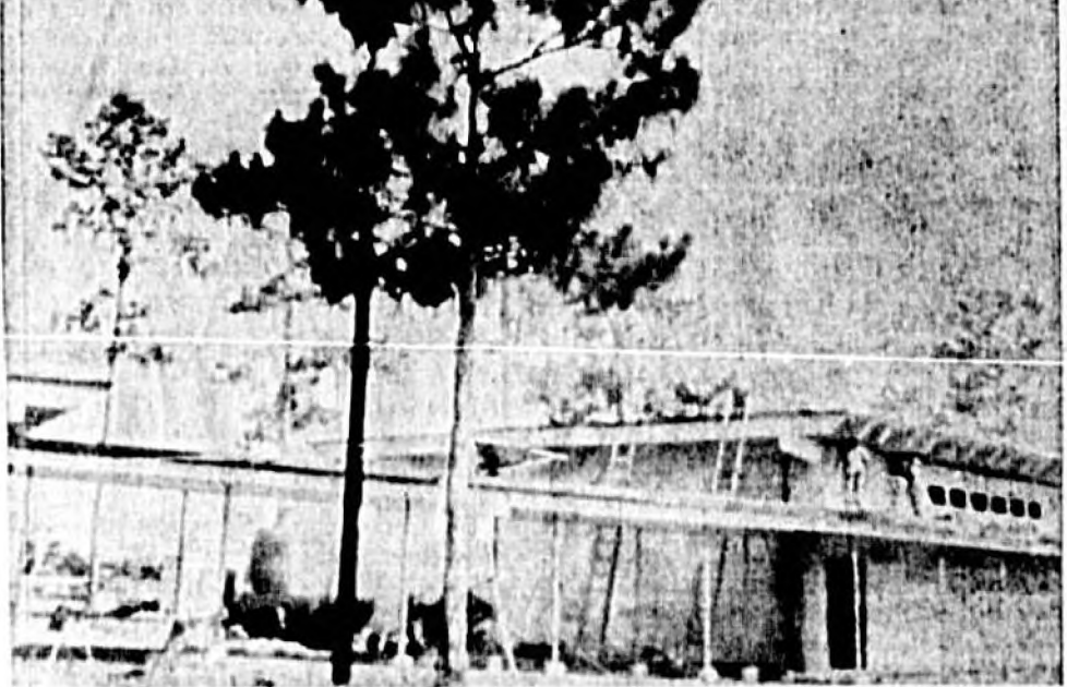
WORKMEN are putting the finishing touches to the new music and science wings at Lyman High School.