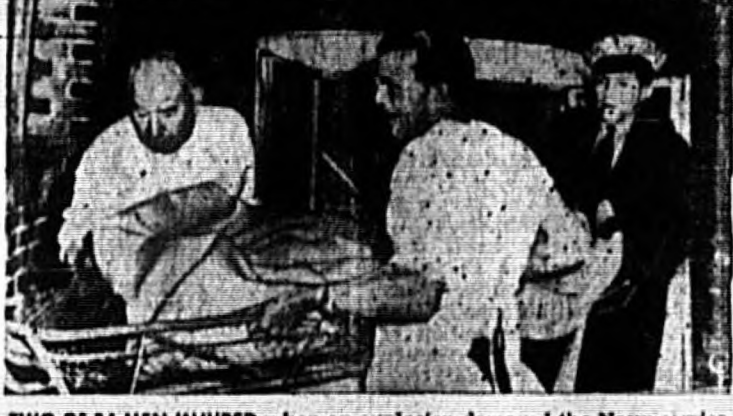
TWO OF 34 MEN INJURED when an explosion damaged the Navy carrier Antlerdam, docked at the Hunters Point Navy Yard, San Francisco, are shown after their removal from the vessel. One of the injured (top) receives first aid treatment, while below, another blast victim is removed from an ambulance for hospitalization.