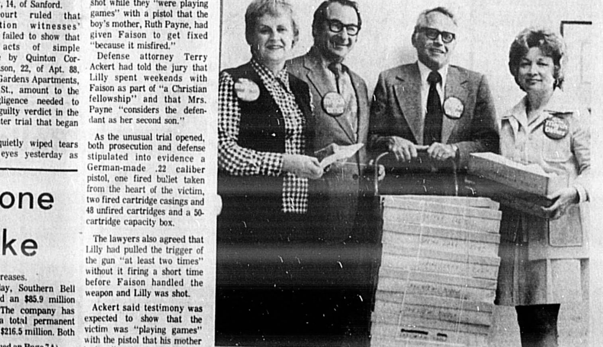
MOD TO ASK STUDENT HELP. Seminole County school students will be asked to participate in the annual March of Dimes campaign this year and MOD officials have contribution cards for the students ready for distribution.