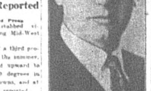
Birrou, Ethiopian official, sent to Japan on secret duty.

Ethiopia Will Open First Consulate In Tokyo At Once