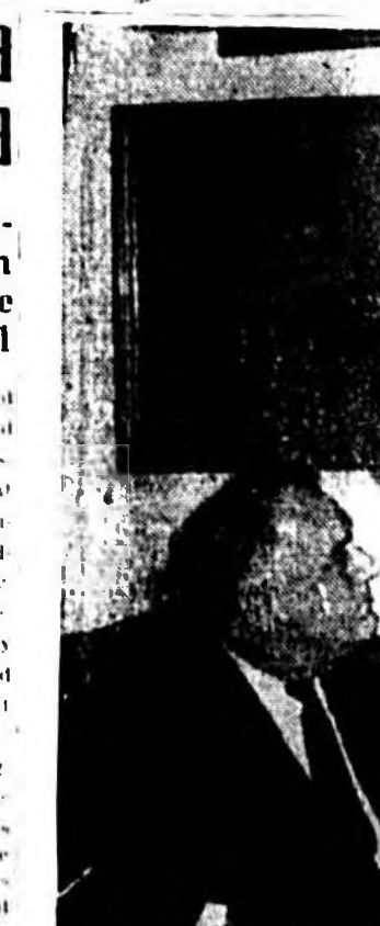
Harry Hopkins is shown taking the oath of office as Secretary of Commerce from the hands of Stanley Reed while President Roosevelt looks on.