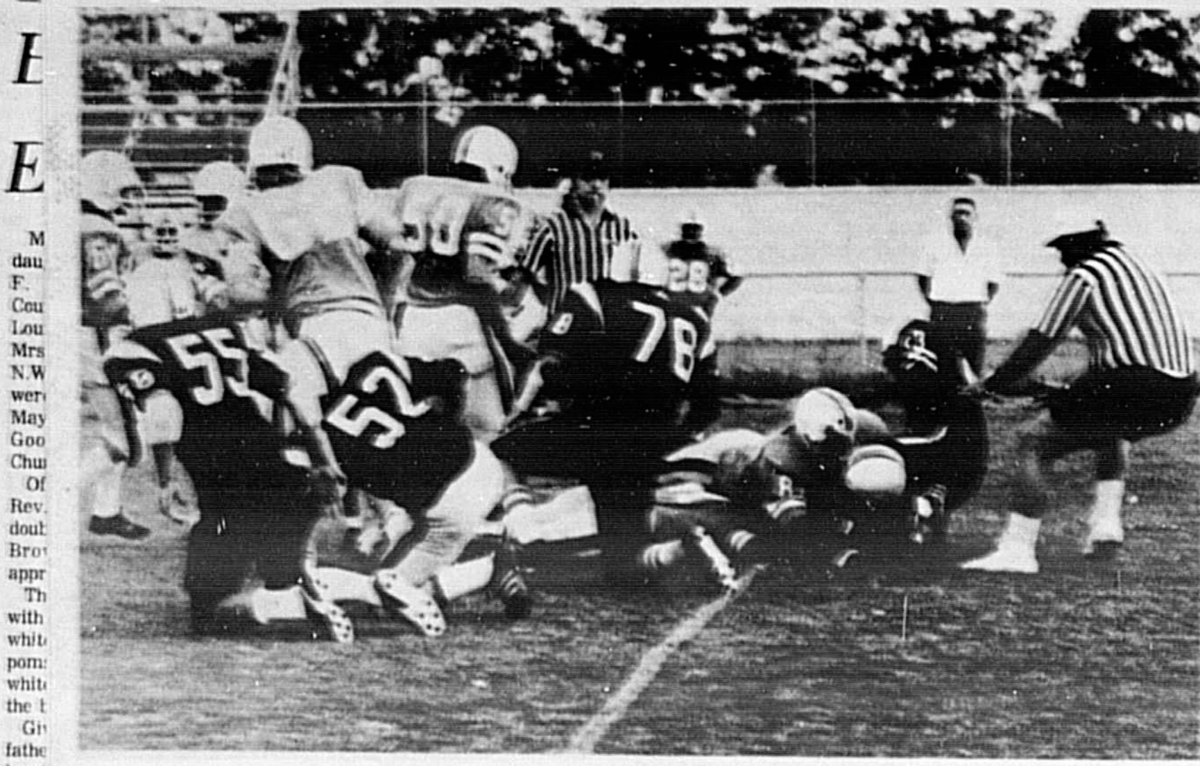
Varsity back finds yardage up the middle

Tough going up the middle was the rule Friday night for the Seminole High Varsity against the graduating seniors, but they came back to take a 22-6 win in the fourth period after their ground attack set up several key passes.