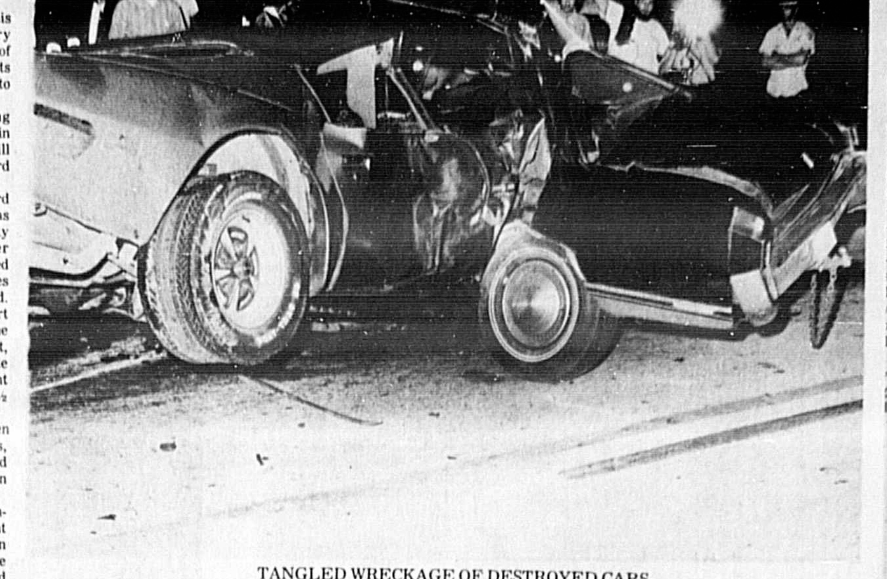
TANGLED WRECKAGE OF DESTROYED CAR'S. Three people killed in 120 m.p.h. crash