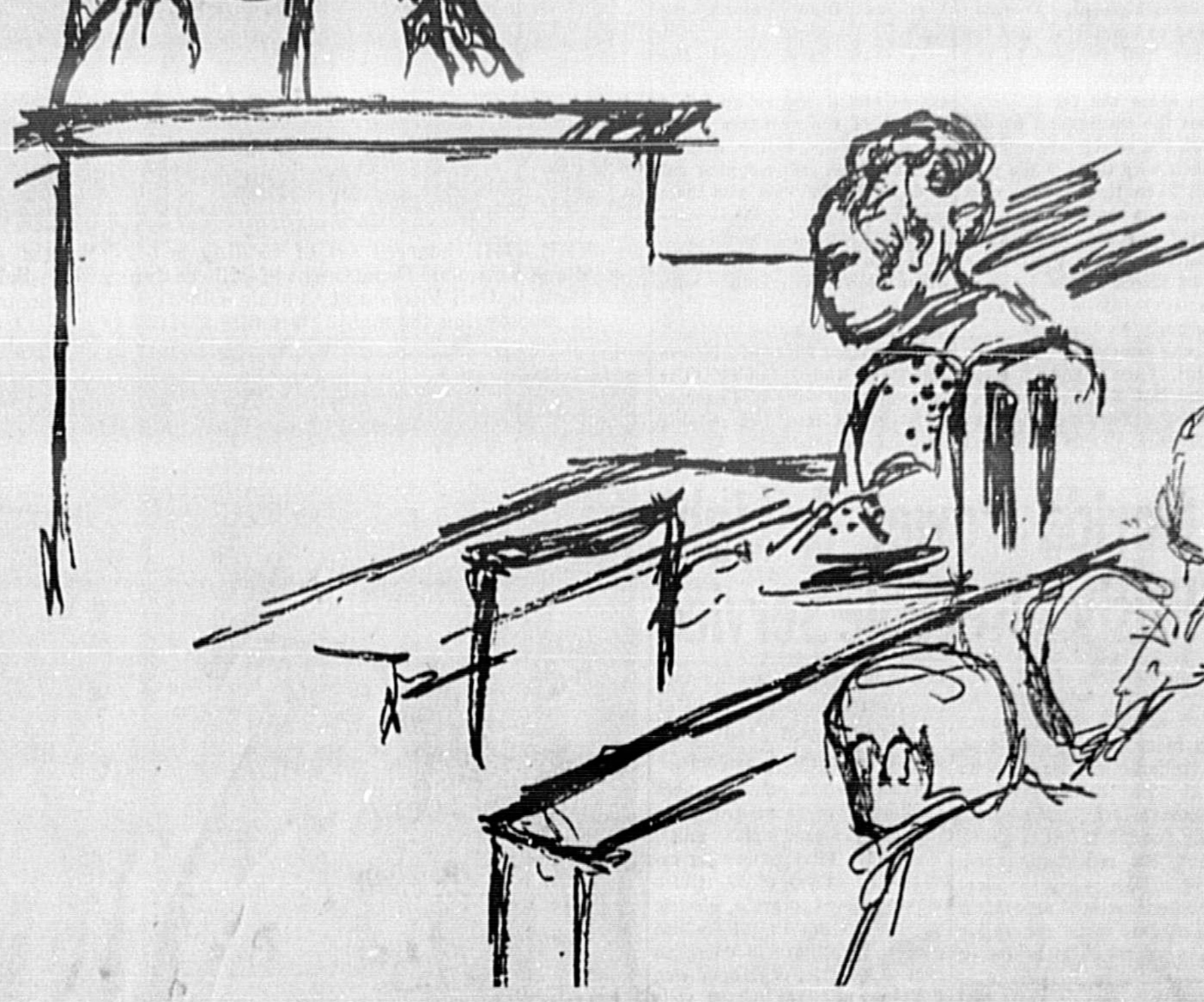
AS THE TRIAL BEGINS . . .

while the trial is in progress. They are also forbidden to discuss the case with anyone. Judge Rumberger after having witnesses sworn dismissed them for the day, but reminded them they could be called at anytime. The remainder of the afternoon will be taken up with the selection of jurors with the procedure continuing Tuesday morning if necessary.