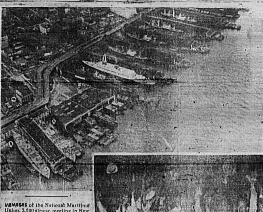
MEMBERS of the National Maritime Union, 3,500 strong, meeting in New York (right), vote approval of the sit-in tactics by 100,000 C.I.O. maritime workers, which has immobilized 700 American ships in all major ports on the ATLANTIC, PACIFIC and in the Gulf of Mexico. Top, are some of the 150 vessels trapped at their piers in the Port of New York. Continuation of the strike is expected to make 24,000 seafarer men idle in a short time as all port activity stops.