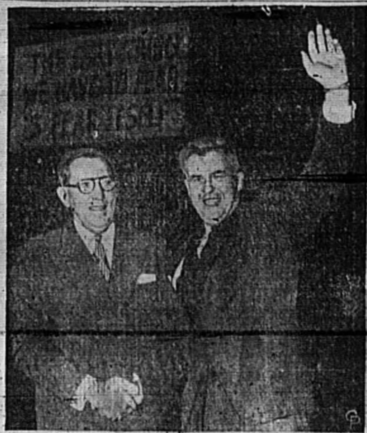
FORMER VICE-PRESIDENT Henry A. Wallace waves to the 10,000 persons who heard his address in the Watergate Amphitheatre on the Potomac River, Washington. He advised President Truman and Secretary of State Marshall to scrap the country's present policy and confer with Premier Stalin and Foreign Minister Molotov in Berlin. Wallace said that the U. S. must grant a long-term, low-interest loan to Russia. At left is Senator Claude Pepper of Florida.