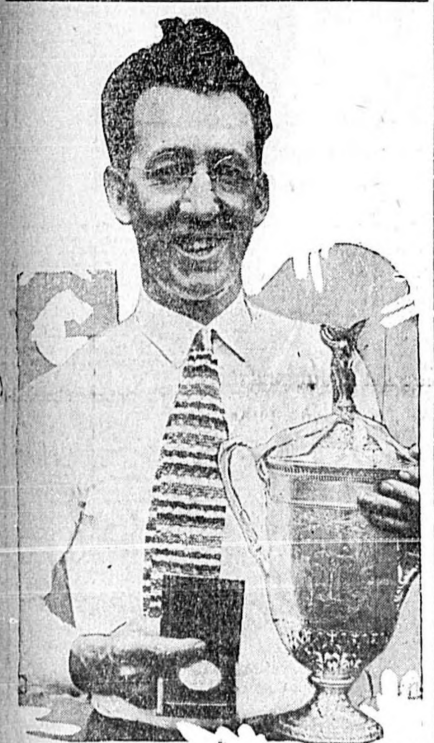
Presenting Mr. Willie MacFarlane, new national open golf champion. He is shown with the medal cup that he won in the blue ribbon classic at Worcester, where he finally beat Bobby Jones after one of the hottest struggles in the pastime's history.