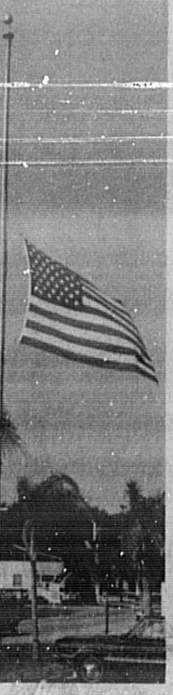
FLAG LOWERED ... In memorial