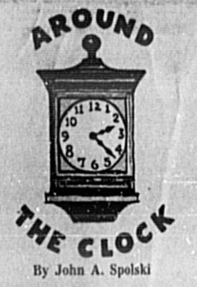
AROUND THE CLOCK

approximately 75 area people, said Cost. The two-story structure also will have a swimming pool, dining room, coffee shop, cocktail lounge and gallery, Cost added. "We are bringing this project to Seminole County primarily to serve the needs of the community," Cost stressed, adding that the motel's attraction to passing motorists is secondary. "We feel that a convention facility can offer a sorely needed service to the area," Cost said. Travelodge's headquarters are in El Cajon, Calif.