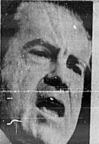
PRESIDENT NIXON ... Popularity slips