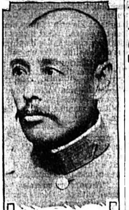
This is Gen. Wu Pei Fu, military dictator of the Peking government, who is leading the fight on the Chekiang rebel army.