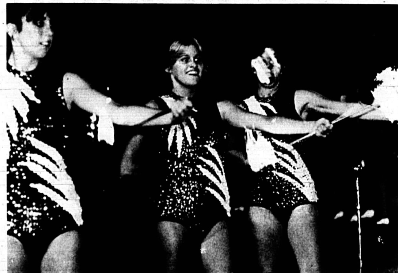
The event will feature majorettes, too.

EVENT: Annual Seminole High School Band Festival WHERE: Lyman High School Stadium WHEN: 8 p.m. Saturday November 8