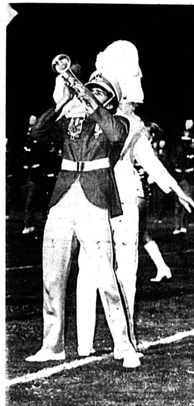
A musician belts it out.