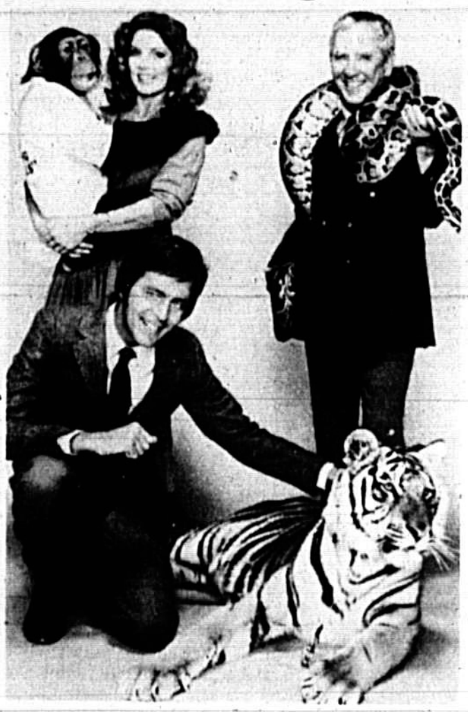
Priscilla Presley, Jim Stafford (bottom) and Burgess Meredith star in ABC's "Those Amazing Animals."