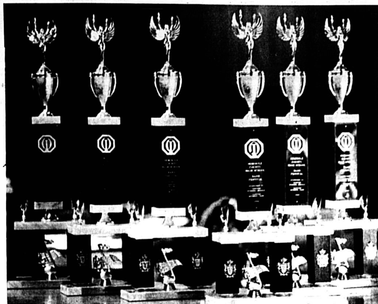
Trophies will be presented.

EVENT: Annual Seminole High School Band Festival WHERE: Lyman High School Stadium WHEN: 8 p.m. Saturday November 8