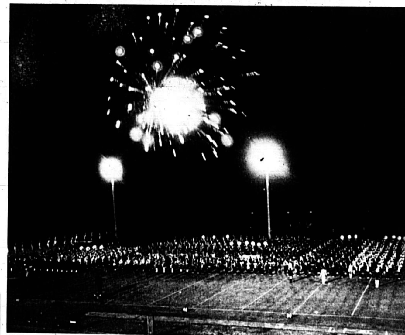
1,200 musicians plus fireworks.

Tickets for the festival are available from band members, the Evening Herald, and at the gate. They are $2 for adults and $1 for children.