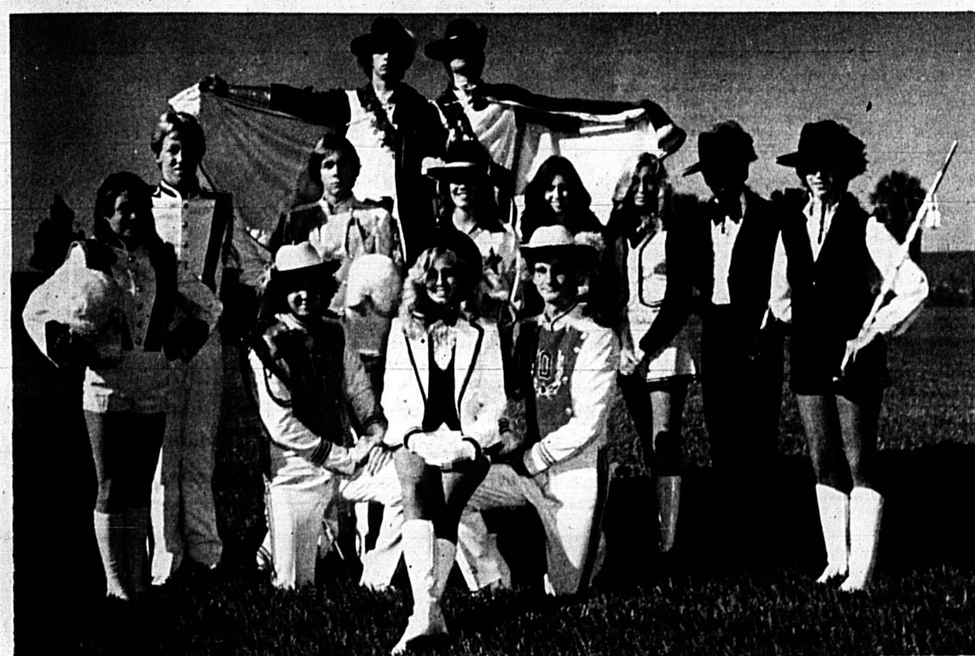
These drum majors, drum majorettes and assistants will be putting their high school bands through their paces November 8 for the 6th annual Seminole County High School Band Festival.

Complete Week's TV Listings Sarasota, Florida — Friday, October 31, 1980