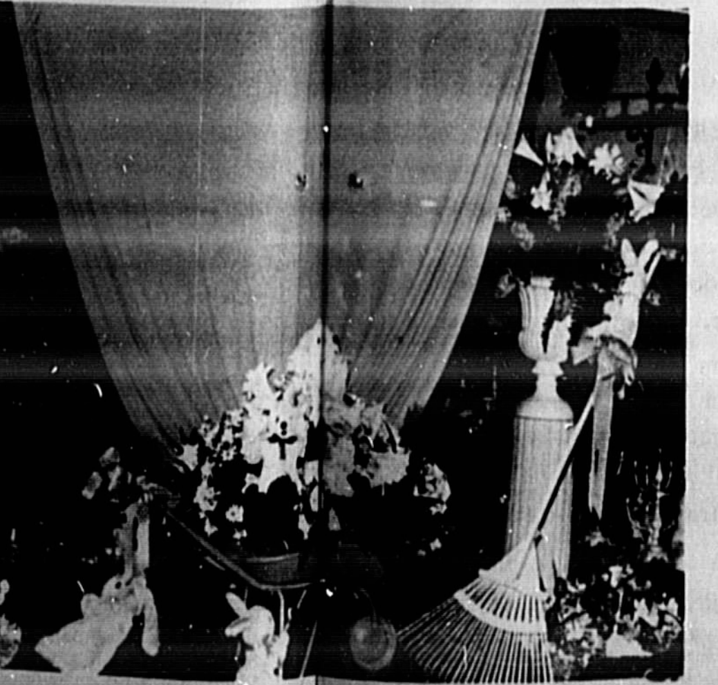
We all associate Spring and Easter with flowers and you couldn't find a more attractive floral display than the window at Sanford Flower Shop, 209 E. Commercial Ave. Inside you will find beautiful potted Easter Lilies, Anemones and Gladioli. Corsages for Easter include Orchids, Roses and Carnations to name a few. Come in and browse around the selection is breath taking or call 322-1822.