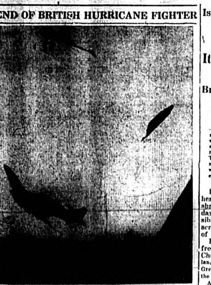
An automatic camera in a German Messerschmitt 109 fighter plane made this spectacular record of the end of an English Hurricane fighter in a battle over the English coast, according to German caption accompanying photo. One wing torn off by blast from German plane, the Hurricane plunges earthward, wing falling at right and pilot in parachute just opening at top.

LONDON, Dec. 25.—(AP)—Britain and Germany enjoyed a brief truce on Christmas day. The British government announced that there were no casualties and the government was not threatened.