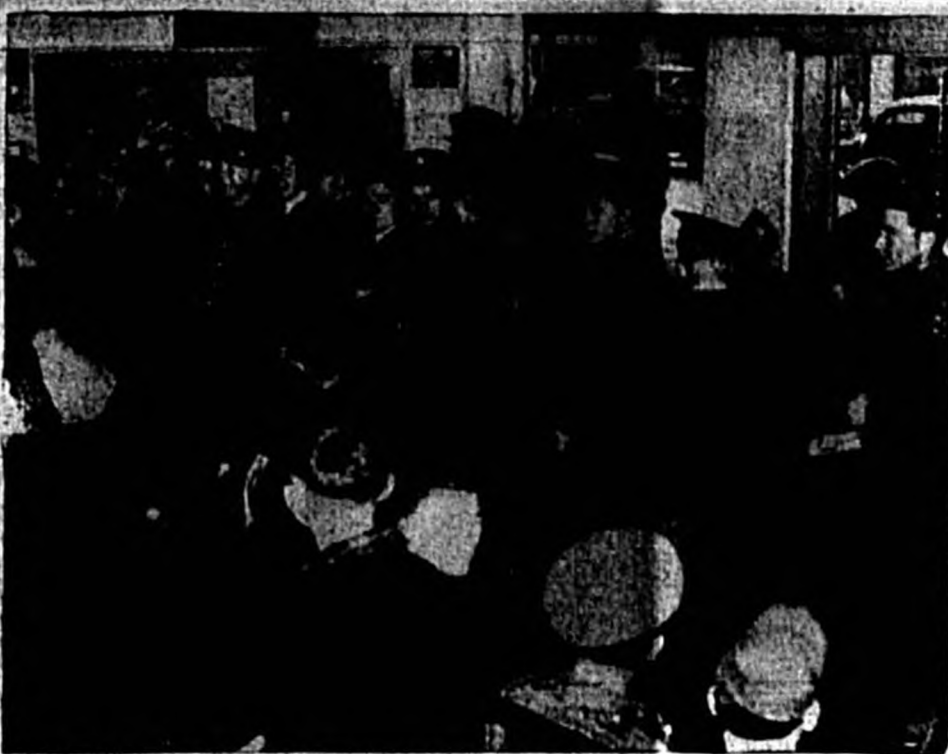
Soldiers from nearby Fort Benning line up for tickets at the Columbus, Ga., bus station as more than 7,000 troops at the post were given Christmas leaves. Note the happy warping of the bottle. The army declared a partial pay day early to help tide the boys over the holiday season.