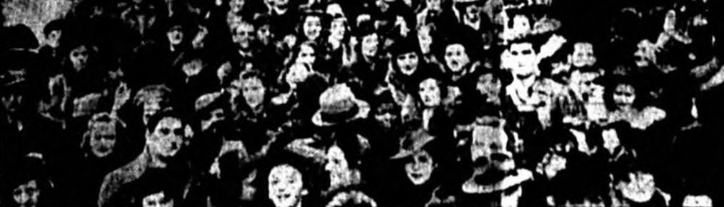
If you don't think Chicagoans bought a lot of Christmas presents, have a look.