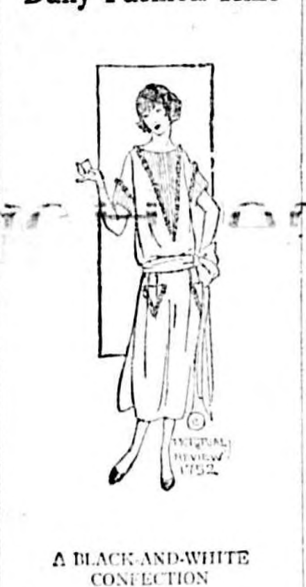
A BLACK-AND-WHITE CONNECTION