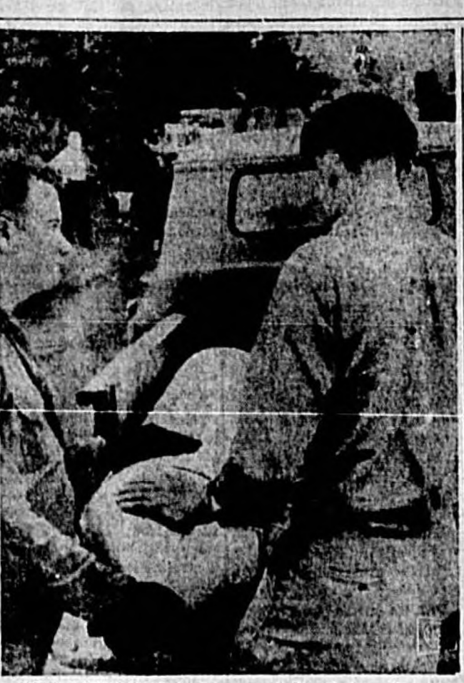
RESCUERS UNLOAD a specially designed capsule at Hazelton, Pa., with which they were to attempt today to bring three men up from the mine in which they have been trapped for two weeks.

MIAMI (UPI)—Hurricane Beulah doubled across the Atlantic today, flinging 100-mile-an-hour winds over open water. The season's second tropical storm increased speed from 12 to 24 miles an hour during the night and early morning, but weathermen said no North American land mass was in danger. An 11 a.m. EST advisory placed the hurricane at latitude 32.7 north, longitude 57.2 west, or about 385 miles northeast of Bermuda. With gales faying the water 250 miles to the northeast and 150 miles to the southwest, Beulah was churning along a northward course. The Miami Weather Bureau said also it was watching other "areas of unsettled weather." An easterly wave 30 miles east of the Lesser Antilles was drifting slowly northwestward "with chances good for some slow intensification." Considerable cloudiness and shower activity north of the Bahamas and east of North Florida also caught the weather bureau's eye.