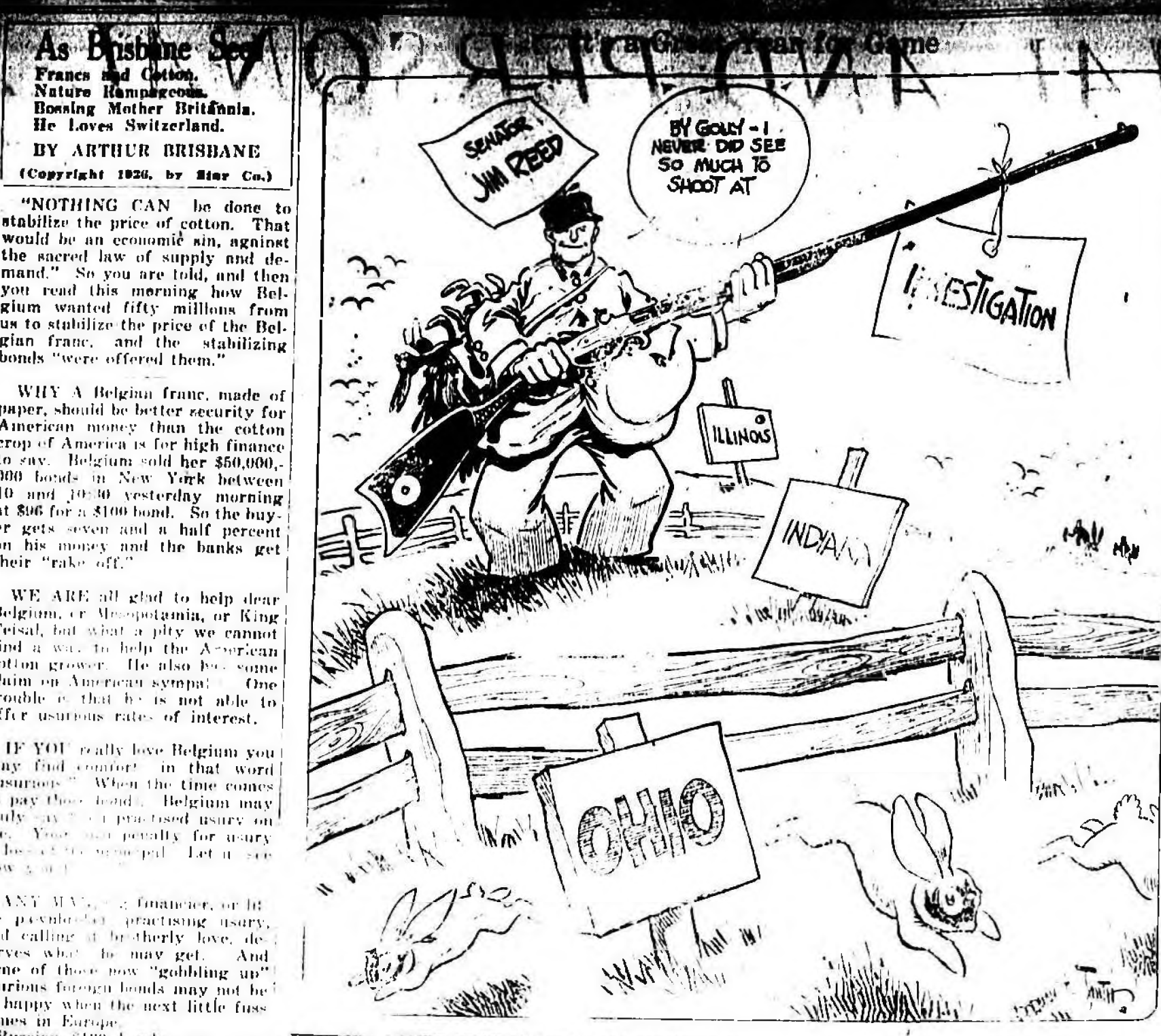
AN O. F. S. CLUB SARASOTA HERALD