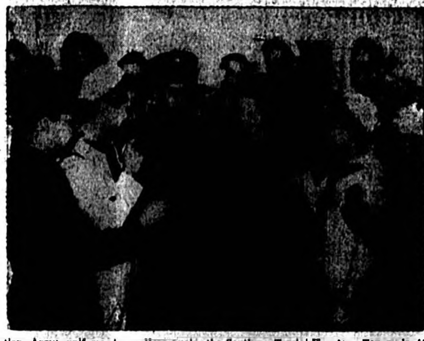
The Salvation Army uniform is welcomed with exceptional delight...