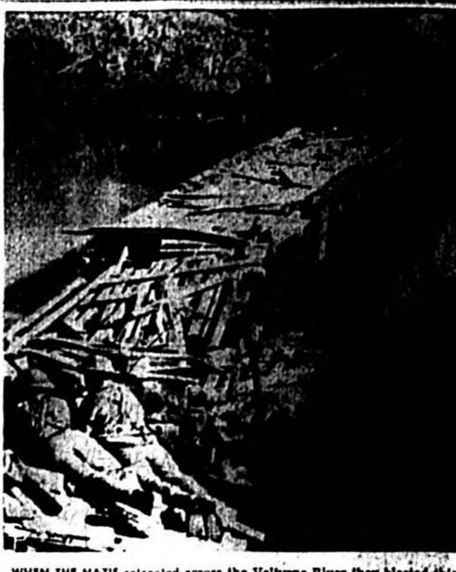
WHEN THE NAZIS retreated across the Volturno River they blasted this small bridge. Ten British soldiers attached to the Fifth Army were engaged in repairing a larger bridge within enemy gun range further along the river.

Worms in your bowels. And roundworms can cause real trouble inside you or your child.