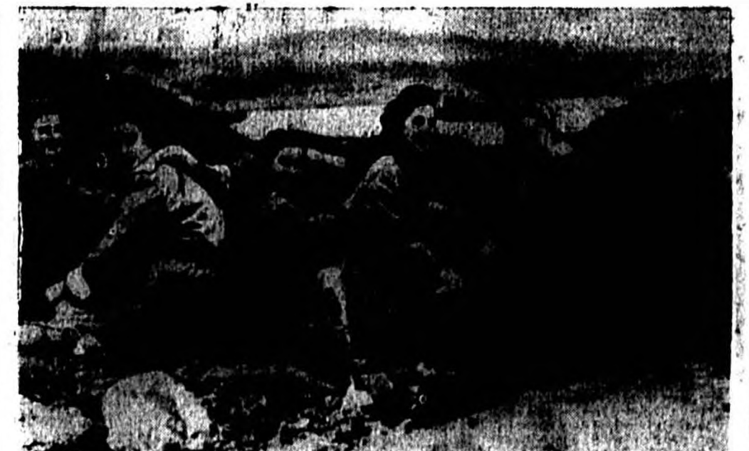
URSSES ASSIGNED to the American Naval Hospital at Adak, in the Aleutians, relax on a bleak hillside during their off-duty hours...