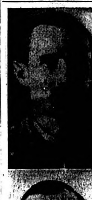
PRIME MINISTER Churchill has named Lt. Gen. Sir Herbert Lumsden (top) as his representative to Gen. MacArthur in the southwest Pacific.