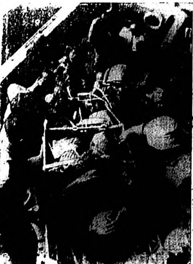
A wounded U. S. Marine covers his pain-wracked face as he is lifted aboard a transport anchored off Bougainville in the Solomons. He was ferried from the beach to the vessel by landing barges after he had been shot during the initial landing. It is reported that American forces have consolidated the beachhead at Empress Augusta Bay to a distance of more than eleven miles. This photo, one of the first received from Bougainville area, was radioed from Honolulu.

WOMAN who is first class in dressing chickens, $1.00 per hour. Palmetto Grocery, 517 Palmetto Ave.