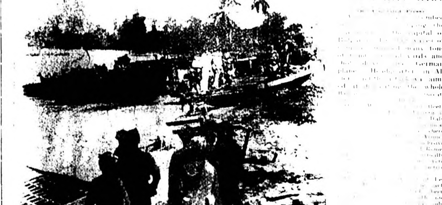
Marines Establishing Base On Longaville