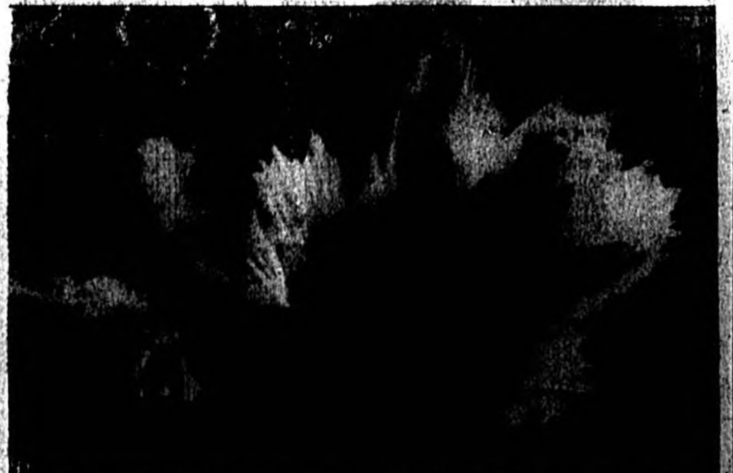
AN EXPLOSIVE BIRTH CHARGE threw a tremendous cloud of white gas a few miles from the coast...