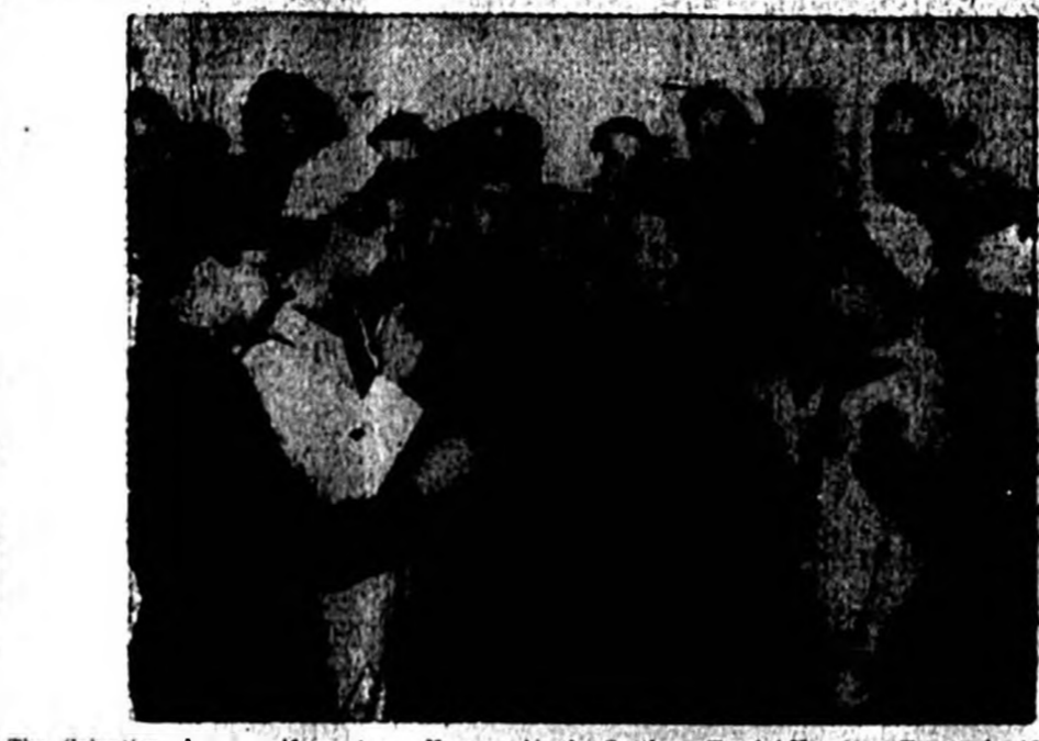
The Salvation Army uniform is welcomed with exceptional delight, and, still further, the numerous Red Shield Clubs, entirely a part of the regular Salvation Army programme and not associated with USO.