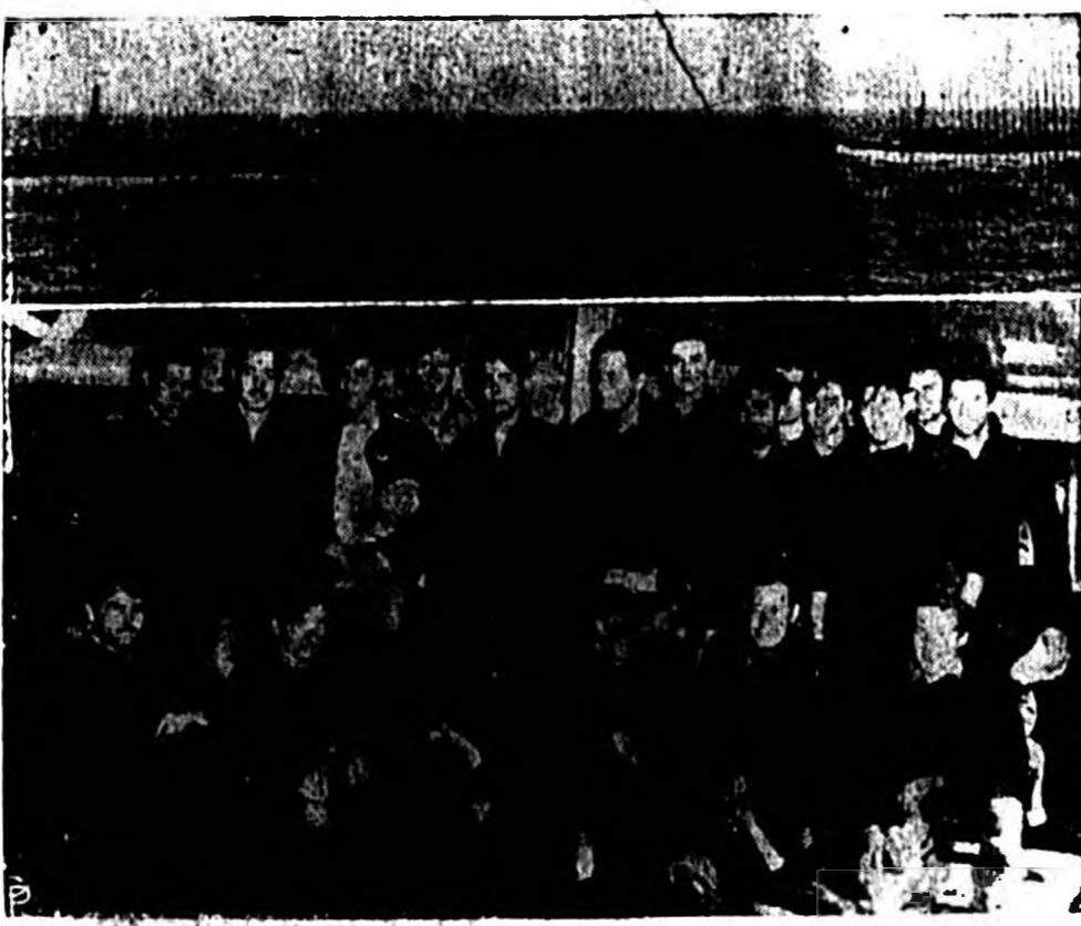
The top picture made from the escort aircraft carrier Carl shows the half-sunk U.S. destroyer Borie (right) just before she was hit by depth charges dropped by planes from the aircraft carrier Carl.