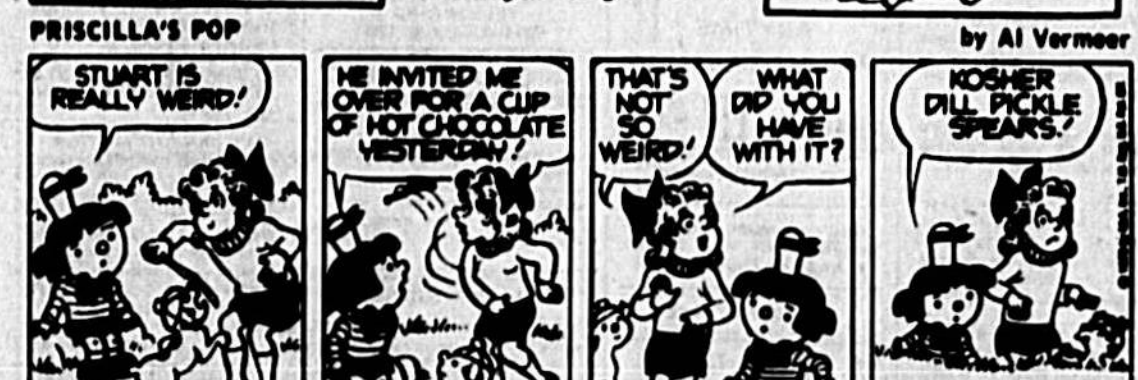
PRISCILLA'S POP by Al Vermorel