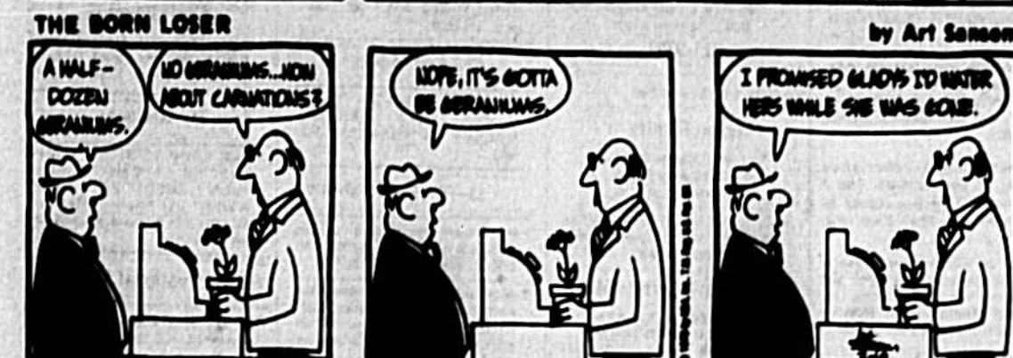
THE BORN LOSER by Art Sanson