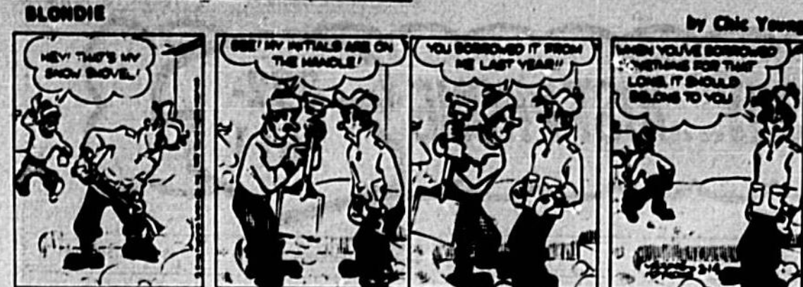
BLONDIE by Chic Young