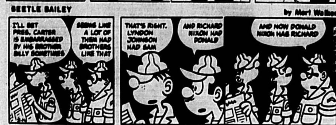
BEETLE BAILEY by Mort Walker