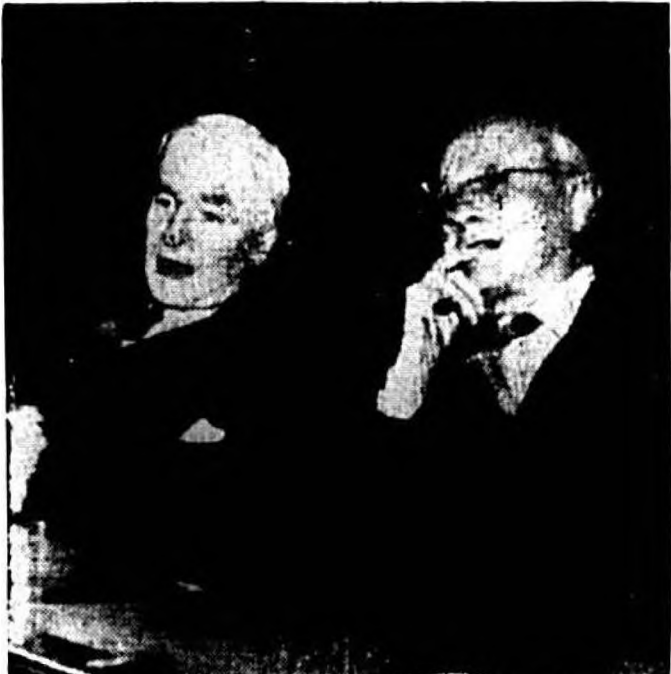
Secretary of State Cordell Hull, left, and former Republican presidential candidate Alfred Lunt, United States delegate to the Pan American conference in Lima, are pictured in a conference.