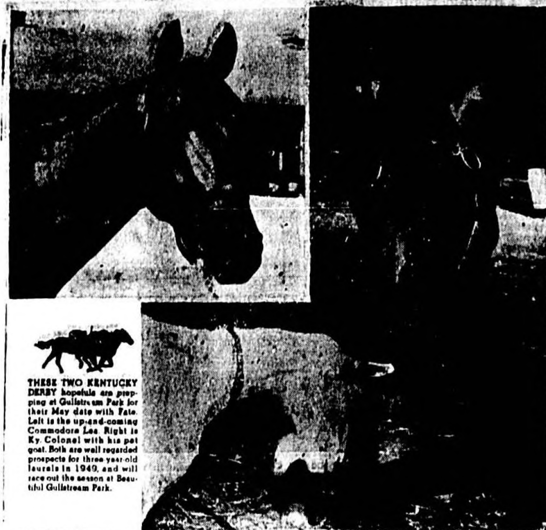
THESE TWO KENTUCKY DERBY hopefuls are preparing to compete at Gulfstream Park for their May date with Pate. Left is the up-and-coming Commodore Lee Right is Ky Colonel with his pet goat. Both are well regarded prospects for three-year-old horses in 1949, and will race out the season at beautiful Gulfstream Park.

AT THE INLET, trout were being taken Sunday in Rockhouse Creek and up Spruce, plus a few bluefish and walleye.