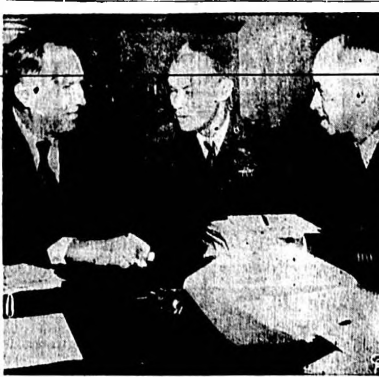
SHORTLY BEFORE HE URGED the Senate Armed Services Committee in Washington to support a bill fixing the active strength of the Army at 377,000, Secretary of the Army Kenneth Royall (left) is shown waiting to testify. With him are Air Force Chief of Staff Hoyt Vandenberg (center) and Army Chief of Staff Omar Bradley. Royall declared that while war is not imminent it is "at least a possibility."