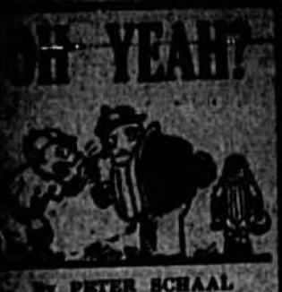
BY PETER SCHAAL