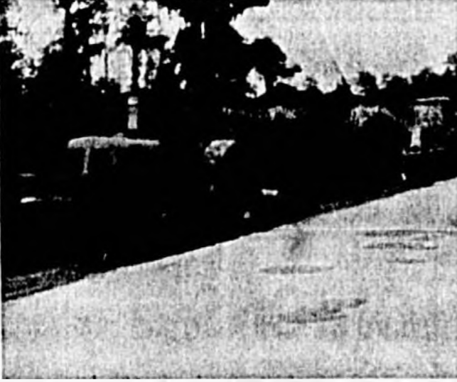
WORK IS progressing on widening Seminole Blvd. to the Seminole Raceway. The project, which calls for widening of six feet, is expected

SAIGON, Viet Nam (UPI) — Authorities today announced the capture of 42 Communist guerrillas who slaughtered helpless Vietnamese trainees at a camp run by the U. S. Army. Informed sources said the Viet Cong guerrillas were part of a 40-man force which murdered 40 anti-Communist tribesmen and wounded 25 others with machine guns, grenades and clubs in a planned raid Jan. 3. Two Ameri- cans were wounded in the nearly five hours of fighting. One of the Vietnamese victims was beaten to death with spiked clubs. Another was tied to a tree and shot. The sources said the Viet Cong suffered 50 dead and an unknown number of wounded in a hastily-organized counter-attack. The raid took place before dawn at a U. S. special forces camp near Plei Mrong village on the Cambodian border, about 25 miles north of Saig- on. The attack was plotted with the help of Communist agents inside the camp. U. S. sources said questioning of the captives, members of the Montagnard tribe, showed the Viet Cong wanted to destroy the camp because it was close to the Chu Prong guerrilla base and one of the main Communist infiltration routes. In preparation for the raid, Red agents inside the camp cut barbed wire fences and distributed ammunition to