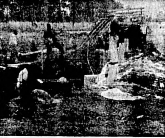
to be completed in three weeks, according to County Engineer Bill Bush.