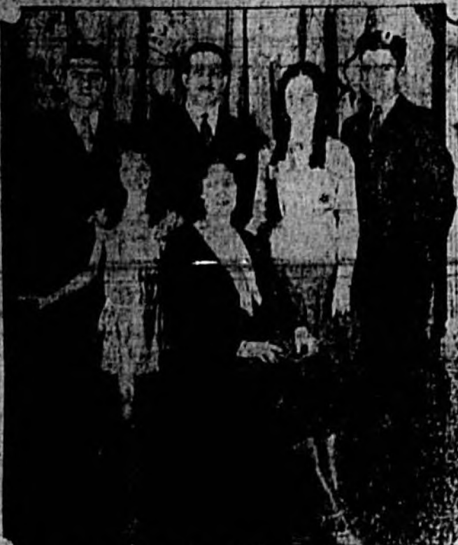
Dr. Ricardo J. Alfaro, Minister from Panama to the United States, who has been chosen by the Supreme Court of that nation to be president, following a revolution there, photographed with members of his family.