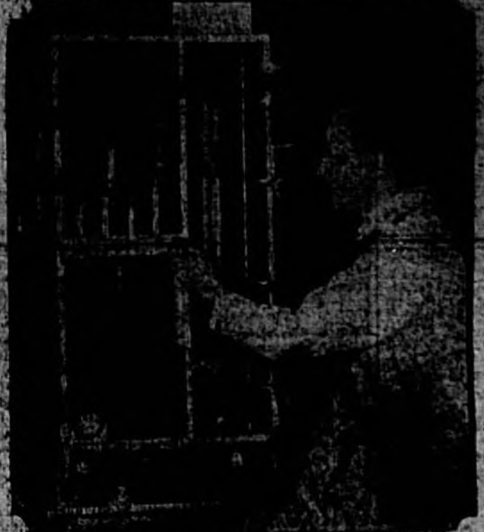
The machine is used to analyze gas mixtures. It is a new type of apparatus designed by Dr. H. D. White of the Bureau of Standards.