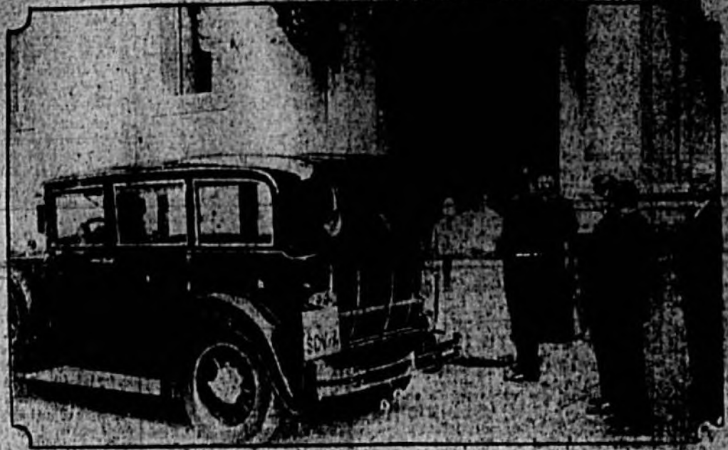
Pope Pius XI in the Vatican gardens with visitors and a dog. He is seen in his usual daily ride through the grounds.