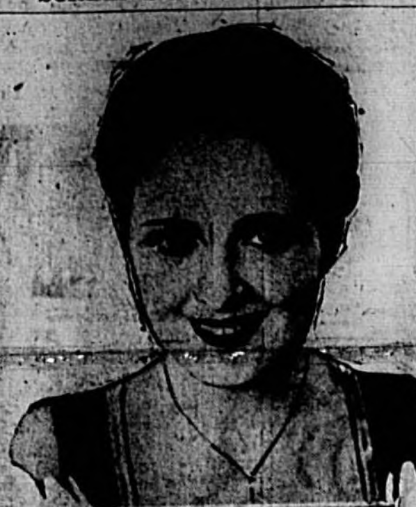
Billie Dove, the Screen's Bird of Paradise, plays the starring role in "One Night in Paris" which will be shown at the Milano Theatre Friday, Douglas Fairbanks, Jr., has the leading supporting role.