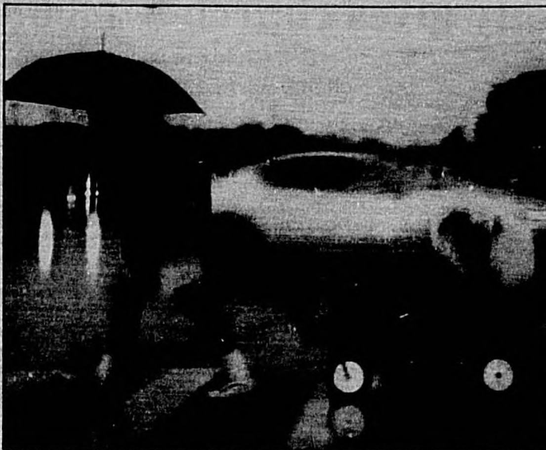
Crossing U.S. Highway 17-92 at Lake Mary Boulevard during a recent afternoon rain shower is no problem as long as you are under your umbrella and snugly seated in your little red wagon. It also helps when you have a grownup to provide the needed leg power to make the crossing a safe one.