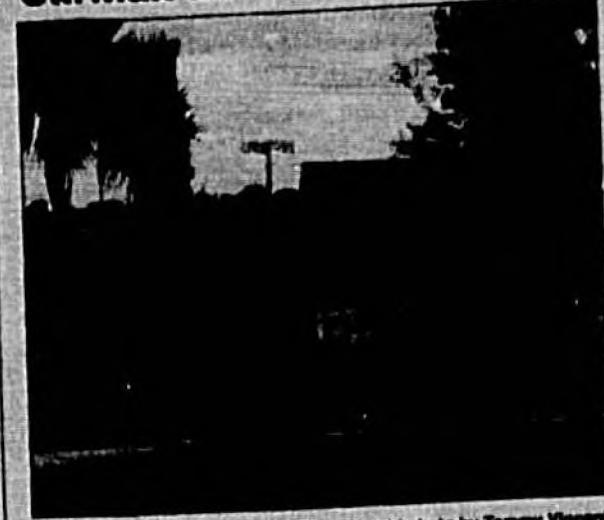
The north end of Pinehart Road is quickly becoming "The Motor Mile," with three new automobile dealerships opening in recent months. A fourth, CarMax is nearly completion of its facility.