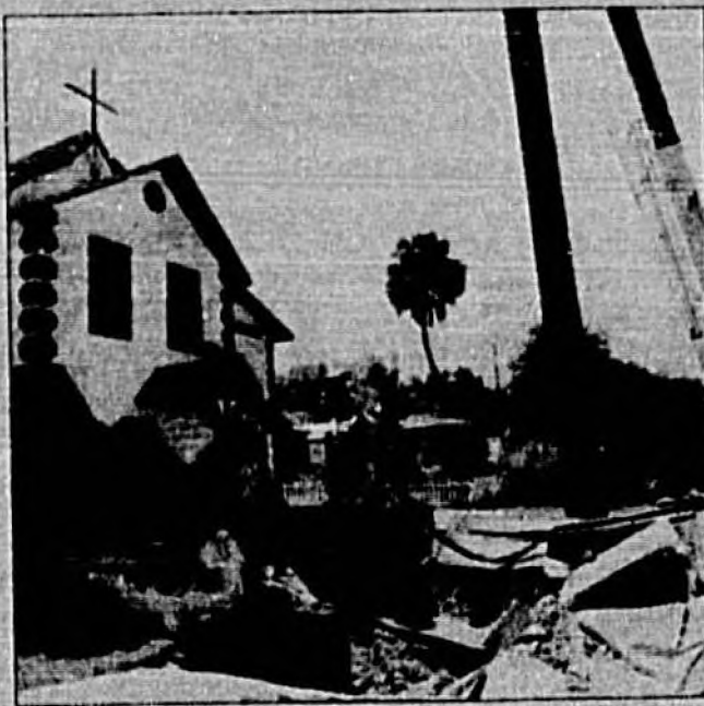
A collapsed stormwater drain at Pine and 6th Street did structural damage to the Victory Temple of God church.

• Decided to continue with United Healthcare insurance coverage for city employees. The city will contribute $299.01 per month for 486 employees, a