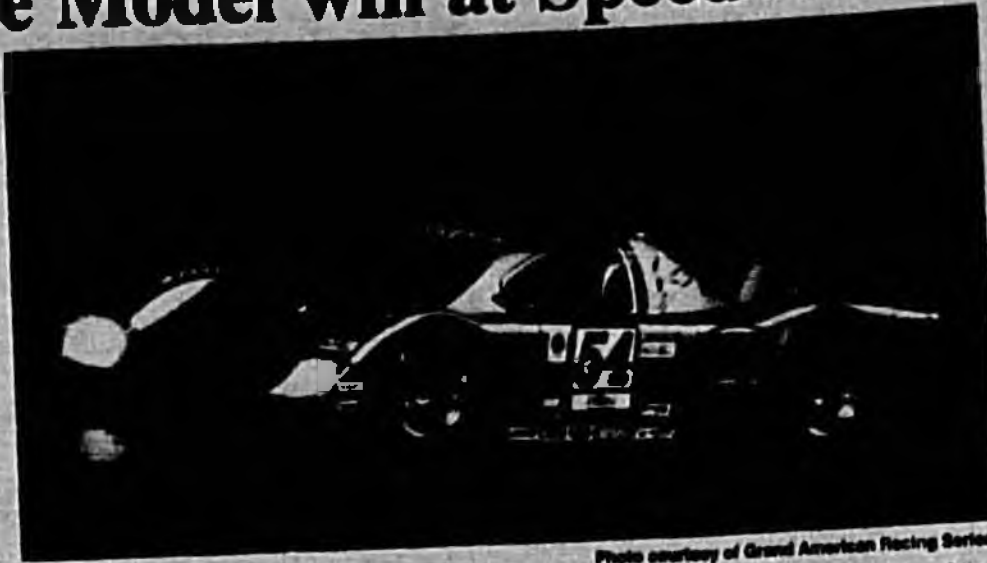
The #54 Chevy Doran JE4 Daytona Prototype of Bell Motorsports earned its third win of the season, more than any other team, at the Paul Rivers 250 last Thursday night (July 3) at Daytona International Speedway.