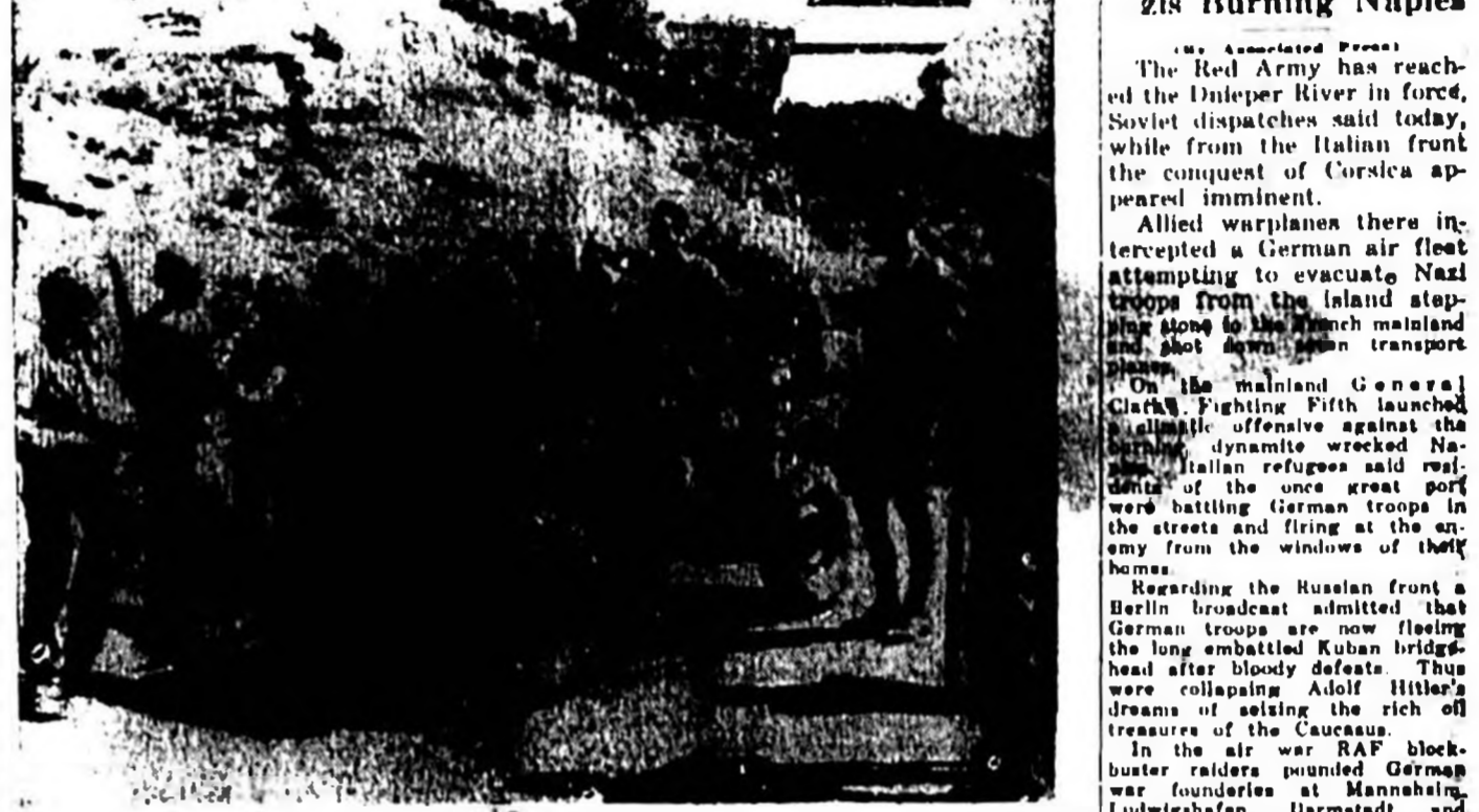
The historic junction of the U. S. Fifth Army and the British Eighth is shown as patrols from both armies meet on a road in the Salerno area. The British soldiers were in the van of Gen. Bernard Montgomery's veterans racing up the toe of Italy's boot to take some of the pressure off Gen. Mark Clark's troops battling at their now enlarged Salerno beachhead.