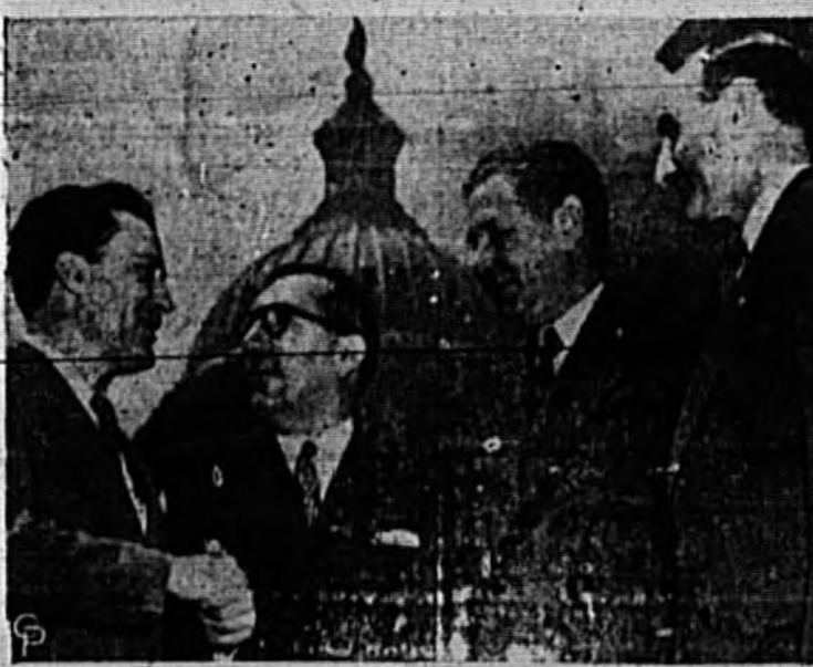
LOSERS IN THE FIGHT against the Taft-Hartley labor bill, leaders in the historic filibusters are shown in a sort of "we-gave-them-a-tough-battle" attitude. Left to right are: Glen H. Taylor (D-Idaho); Claude Pepper, Florida; James E. Murray of Montana and Sen. Wayne Morse (R-Oregon).

Meanwhile, Nanking newspapers carried reports that the foreign office had sent a second protest to the Russians over the recent border clash between Chinese and pro-Soviet Outer Manchurian in Sinkiang province. There was no immediate confirmation. Russia rejected the first protest.