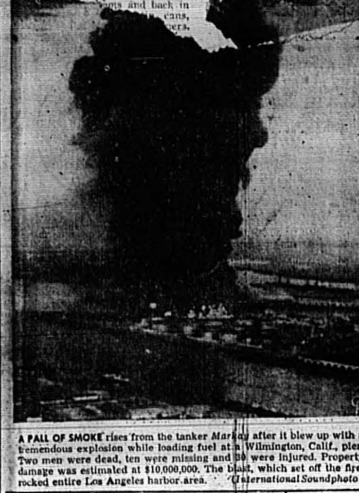
A PALL OF SMOKE rises from the tanker Marilyn after it blew up with a tremendous explosion while loading fuel at a Wilmington, Calif., pier. Two men were dead, ten were injured, and property damage was estimated at $10,000,000. The blast, which set off the fire, rocked the entire Los Angeles harbor area.