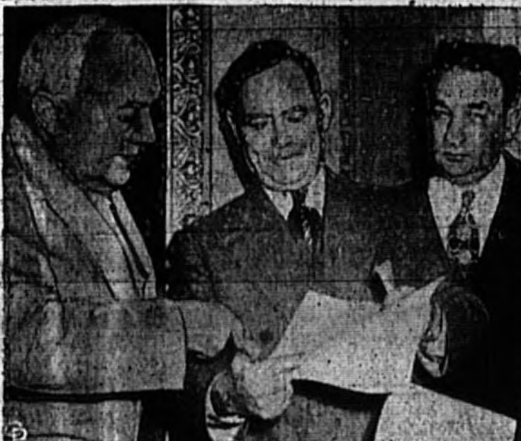
CALLING UPON CONGRESS to override President Truman's veto of the tax reduction bill, ranking G.O.P. leaders are shown giving vent to explosive criticism as they go over the veto message. "Cold blooded politics" and "flagrant abuse of power" were among the expressions voiced by Rep. Harold Knutson (R-Minn.), who championed the measure; Rep. Charles A. Halleck (R-Ind.), House majority leader, and House Speaker Joseph Martin Jr. (R-Mass.).