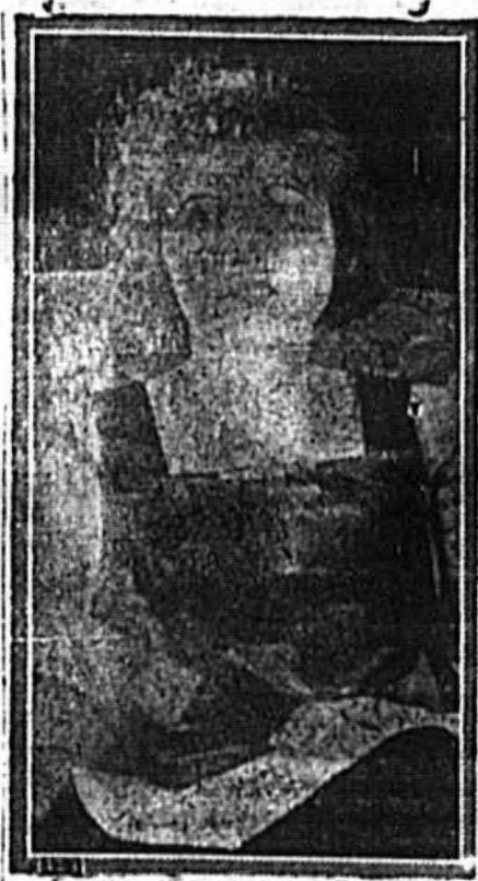
LOUISE GLAUM in "SEX" W. W. MCGOWAN DISTRIBUTOR