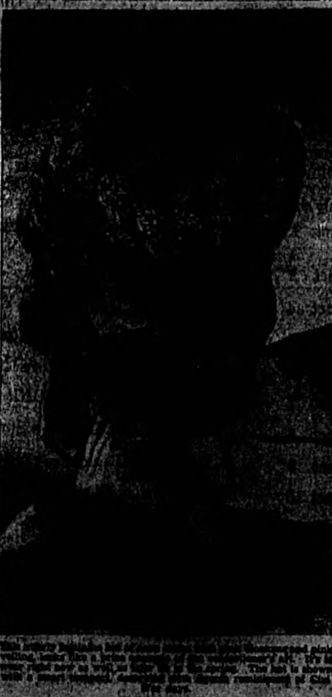
Portrait of a man in a suit, likely related to the Swank Night Spot article.

When the Mammoth Exposition Train pulls onto the tracks at First Street next Thursday to begin 2 days of showings aboard its special railway cars, Sanford persons will have the opportunity of seeing one of the most unusual shows ever to visit the city. Bearing a live cargo of strange animals and exotic furniture from many parts of the world, the big exhibition will be open to the public from noon until 11:00 P. M. daily while here. One of the features will be a free menagerie, located on the car outside the train, in an open air steel car. Here one may see the smallest adult elephant on earth, the world's largest living cow, a huge creature standing nearly 6 feet from horn tip to the ground, and weighing 2,000 pounds, shown together with a buffalo, western plains buffalo, karakul sheep, Texas longhorns, and other animal specimens, exhibited free to the public. In the main exhibition, aboard the special railway cars, will be many unusual animal and human specimens, including the largest living horse, standing 19 1/2 feet tall, and said to weigh 2,000 pounds. Shown also will be a synthetic unker, the largest cow in the world, the largest horse, a Turkish skin, a human baby, an imported British Highland steer, boasting a record of 5 feet, 11 inches, and a living steer, said to weigh 2,000 pounds, together with a number of other unusual live specimens. There will be the London show in which they trained a bear to perform many stunts, with the aid of a man who trained the bear.