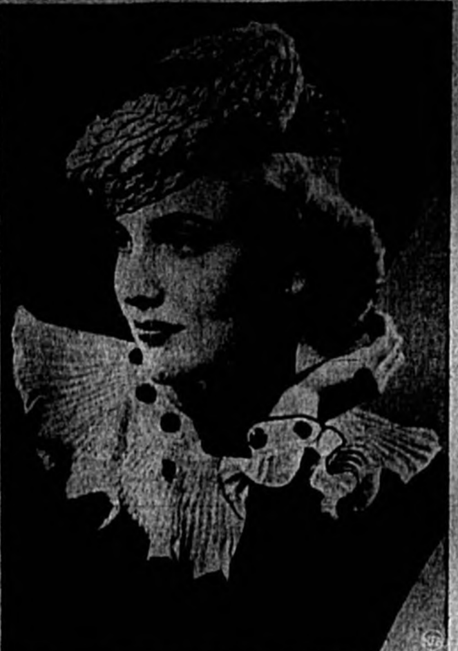
It's time to wear a straw hat, and this delectable pillbox in spongy pink with a wide crushed black moire ribbon and a turn-of-the-century bow is one of the smartest of the new straw bonnets. Wear it with your black afternoon dress on which you've recently put new pink lingerie collar and cuffs.