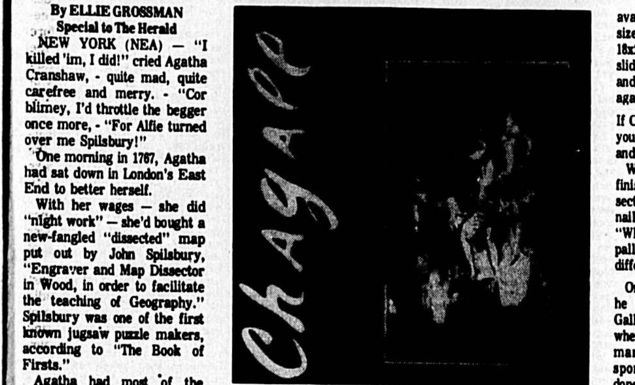
A Chagall picture puzzle from the Gallins Gallery.