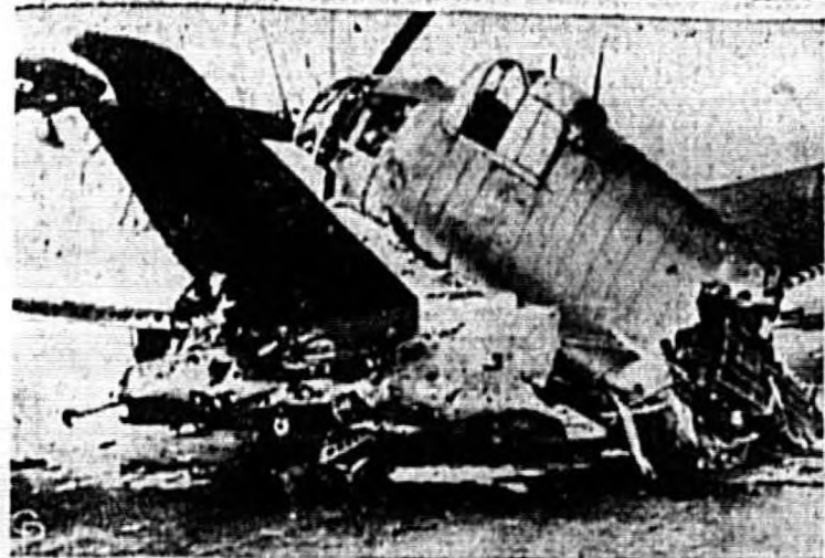
COMPLETELY DEMOLISHED is one of the twenty-one planes wrecked when a pilotless Navy craft smashed into the plane-parking area at the Opa Locka naval air base near Miami, Fla. The pilot parachuted to safety when trouble developed. Several sailors were injured and an officer was killed by flying debris.