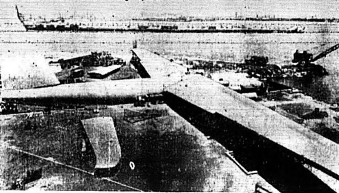
IN THE LAST PHASES OF CONSTRUCTION, Howard Hughes' eight-motored flying plane rapidly nears completion at its base in Terminal Island, Calif. Curved section lying on ground is part of the main tail assembly of the world's largest flying boat. Recovering from injuries, Hughes will see it launched.