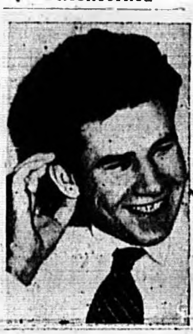
COLLEGE STUDENT William Heiters, 17, who has confessed to three of Chicago's most brutal slayings, smiles on learning that his arrangement for the kidnapping-slaying of Suzanne Degnan and ex-WVA Frances Brown had been continued until Sept. 4.