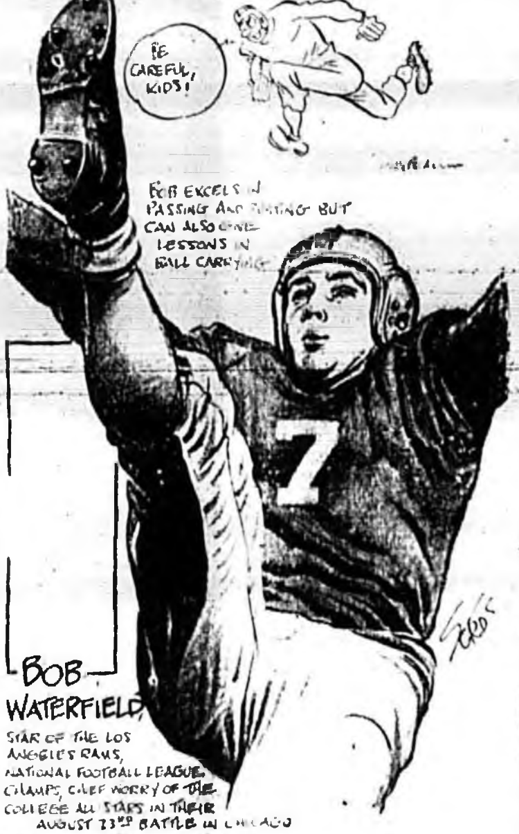
BOB WATERFIELD STAR OF THE LOS ANGELES RAMS, NATIONAL FOOTBALL LEAGUE, CLAMPS, CUFFS WORKY OF THE COLLEGE ALL STARS IN THEIR AUGUST 23 RD BATTLE IN CHICAGO