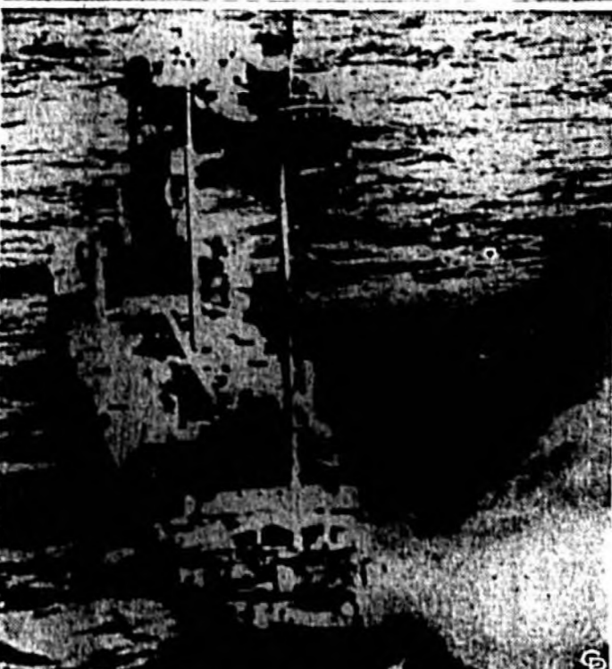
Tragedy At Sea — 20 Dead

Twenty men died as a result of explosion which wrecked the fore part of the Cities Service Oil Company tanker Denver as she was proceeding toward New York eighty miles south of Cape Lookout, N. C. Twenty-one others were rescued. This photo of the stricken tanker (foreground) was made from a Coast Guard plane as another tanker stood by. Notice smoke pouring from the Denver.