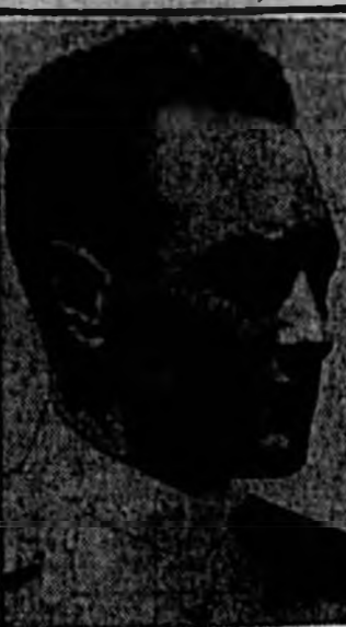
The famous American explorer, Admiral Richard E. Byrd, who has flown across the Atlantic ocean and over both the North and South Poles, will be one of the principal speakers on the Animated Magazine at Rollins College on next Sunday afternoon.