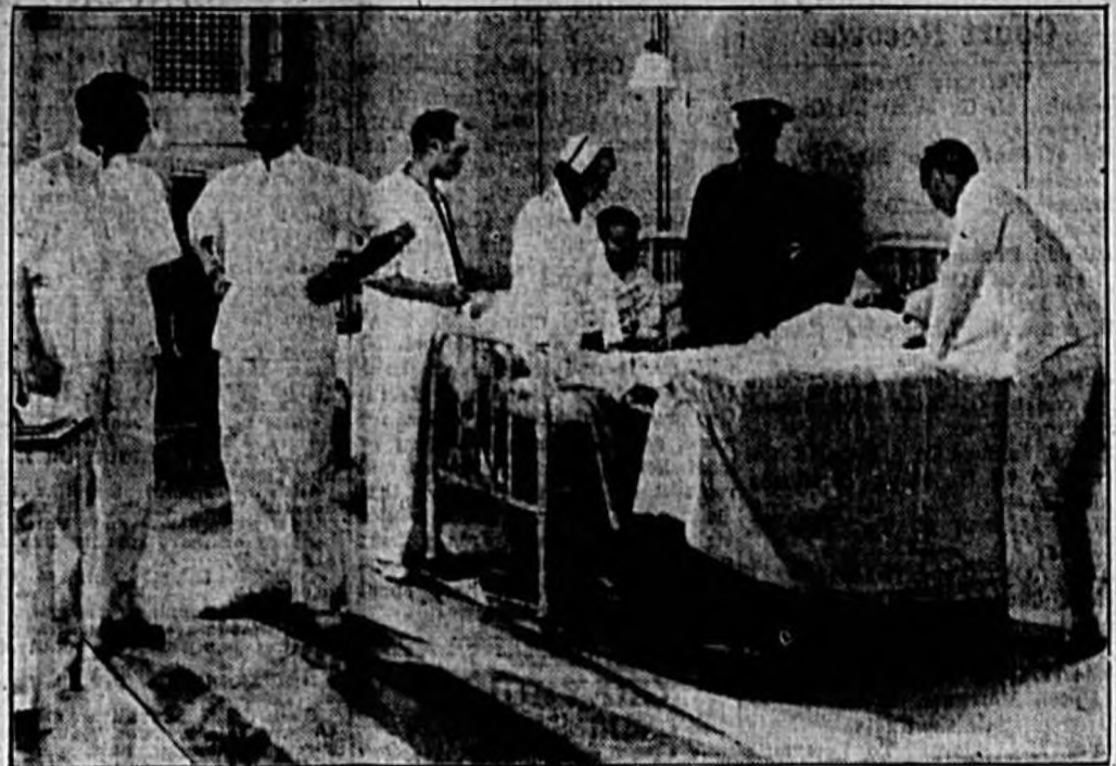
are spent annually by the public to support defectives... will sterilization stop this drain... will it improve humanity?... You'll find the answer in the gripping drama of today "Tomorrow's Children" to be shown at The Princess Thursday and Friday.