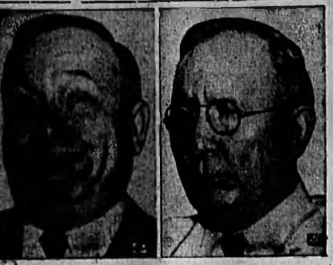
There is no mask to hide the features here of Ka Klux Klan's Imperial Wizard Hiram Wesley Evans. In the national limelight, he laughs, but quickly changes expression as his thoughts turn serious.