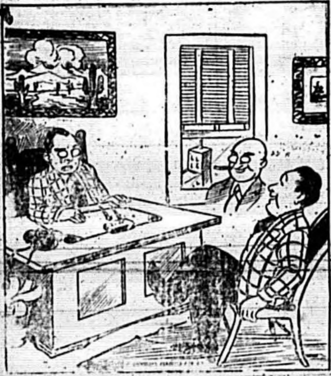
"You'll find the HILL HARDWARE COMPANY your best bet... they have everything, and at reasonable prices."