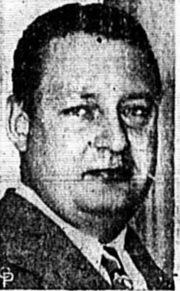
IN A SURPRISE MOVE, Julius A. Krug, (above), 39, former chairman of the old War Production Board, was nominated by President Truman as Secretary of the Interior to succeed Harold L. Ickes, resigned. If confirmed by the Senate, Krug will become one of the youngest Cabinet members in the history of the United States.