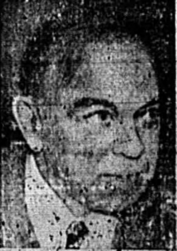
ACCORDING to Prime Minister Mackenzie King of Canada, his government has launched an investigation into the disclosure of "secret and confidential" information—reported to be concerning atomic energy—to members of a foreign mission in Ottawa. Twenty-two men have been detained for questioning by the Royal Canadian Mounted Police.