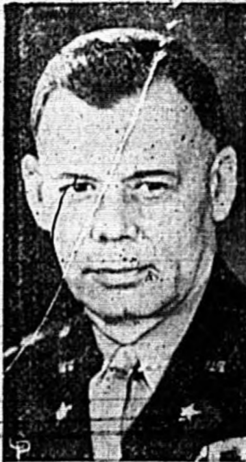
NOMINATION of Lt. Gen. Walter Bedell Smith, (above), to succeed W. Averell Harriman, recently resigned as U.S. Ambassador to Russia, was announced by President Truman. The President said he'd ask Congress to let Smith keep his Army status.