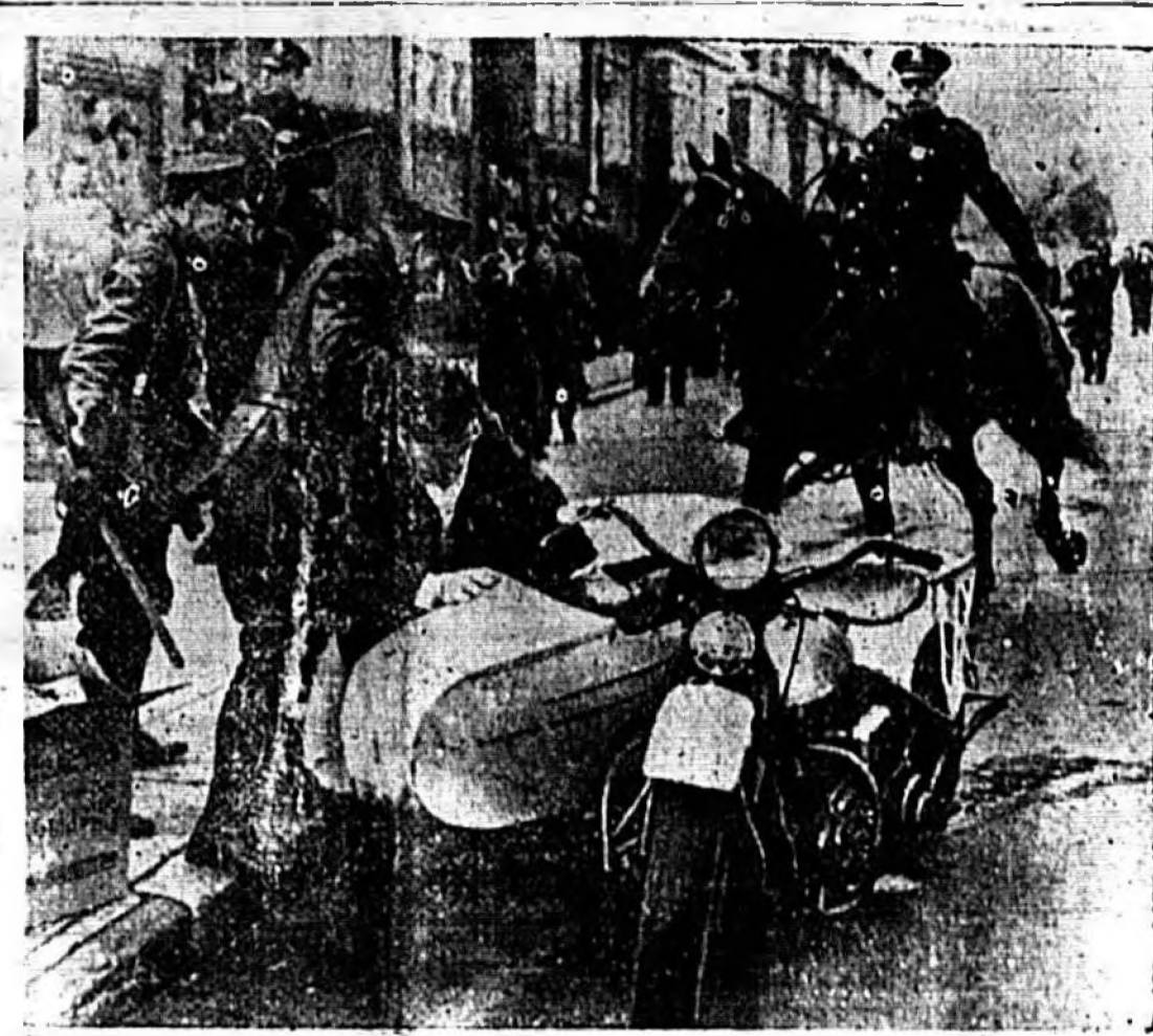
DURING NEW OUTBREAKS which followed attempts at mass picketing by some 3000 strikers at the Philadelphia General Electric plant, one of 18 pickets arrested for defying a court injunction is pushed into a police motorcycle and taken to the police station. Free-for-all fights were frequent as mounted police and patrolmen broke up grade line. A general city-wide sympathy demonstration by CIO Unions was being considered.

Tough Ride For Picket Nabbed In Philly Riots