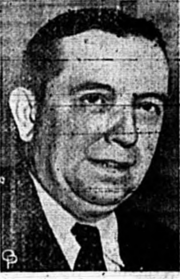
ASSISTANT Secretary of the Interior for thirteen years, Oscar L. Chapman, (above), 49, a native of Virginia, has been named by President Truman as Acting Secretary of the Interior. He will serve in that capacity until a successor to Harold L. Ickes, resigned, is nominated by the President.

See one of the many items brought to be purchased through your Sears Order Blank. Sears Roebuck & Co. Phone 390