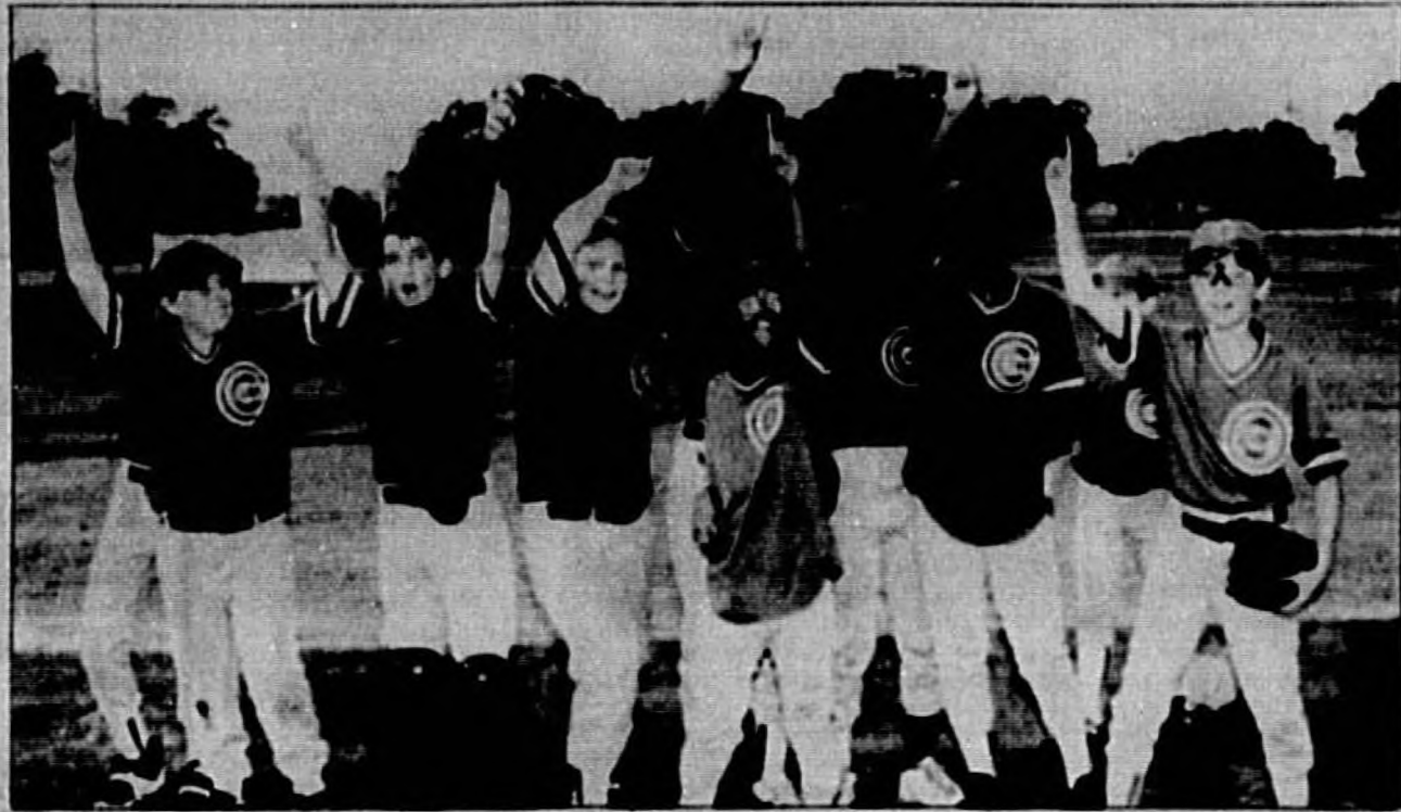
Special Photo by Brian Stangor