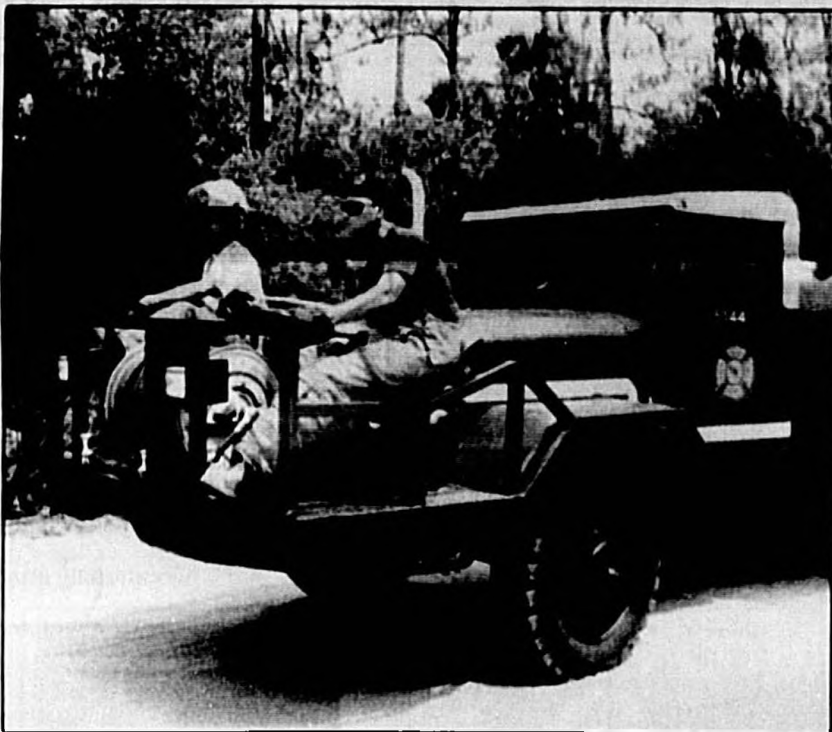
Firefighters used a number of specially equipped vehicles such as this to gain access into forest areas during the battle against the blaze which destroyed approximately 2,000 acres in eastern Seminole County.