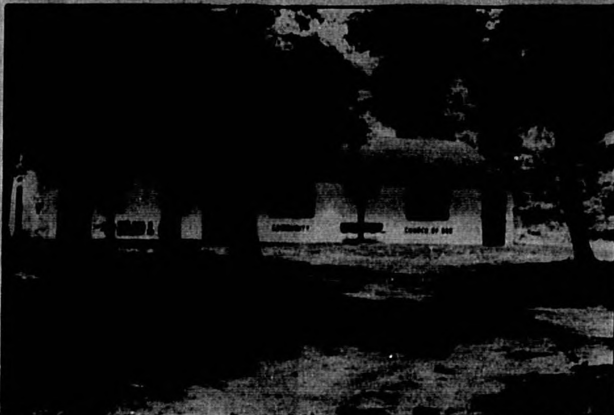
The Geneva Community Church of God is located at the junction of 688 Cochran Road and State Road 46.