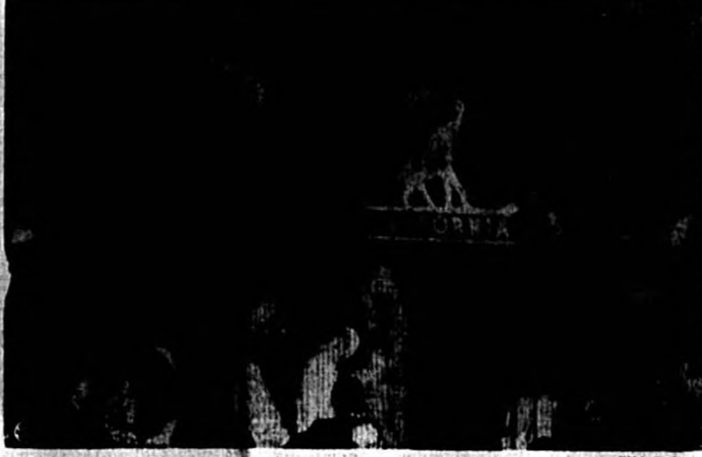
The speech of former President Herbert Hoover before the Republican national convention at Philadelphia, brought delegates to their feet in a noisy demonstration (above). In his address Hoover castigated the New Deal and declared "We are faced with the task of saving America for free men."