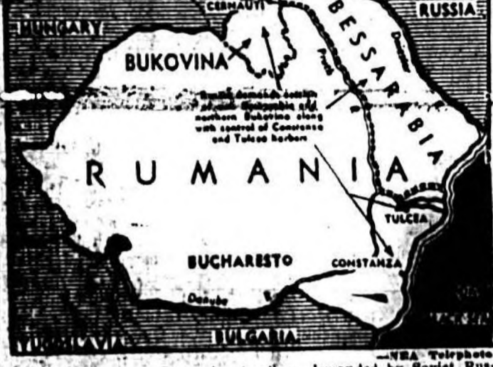
This map shows Rumanian territory demanded by Soviet Russia. Authoritative reports are that the Rumanian grand council has decided to accede to the Russian ultimatum, which was backed up by troops and reported pressure from the axis powers, Germany and Italy.