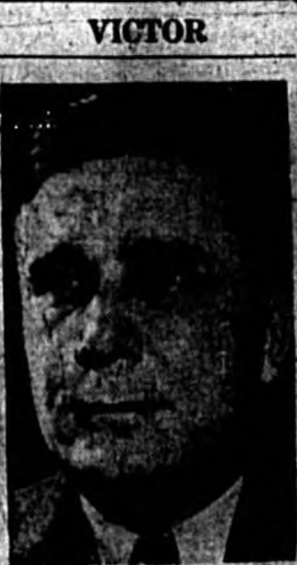
Shown above is Wendell L. Willkie, utility head, and former Democrat, who was named the 1940 Republican standard bearer on the sixth ballot at the convention in Philadelphia last night.