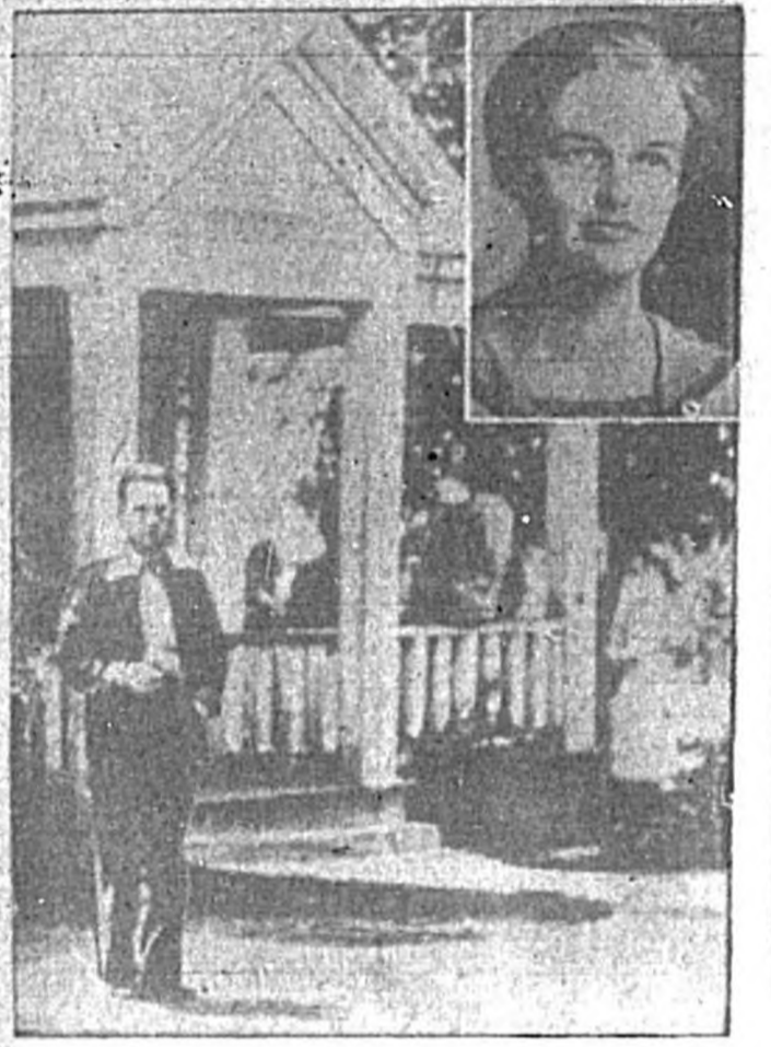
Although he asserted his innocence, the husband of a woman killed by a bullet from a .38 Smith & Wesson revolver was held for trial in the slaying of his wife. The husband, who was charged with the slaying, was held for trial in the slaying of his wife. The husband, who was charged with the slaying, was held for trial in the slaying of his wife.