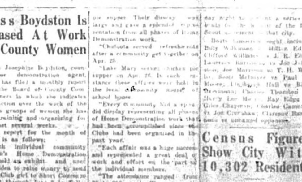
Miss Boydston is pleased with the work of the county women. They have done a great deal of good work in the community.