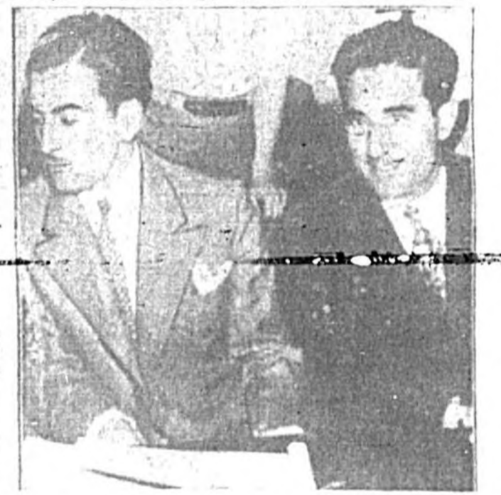
A man convicted of the theft of a large gemstone was sentenced to a term of imprisonment. The gemstone was valued at several hundred dollars.