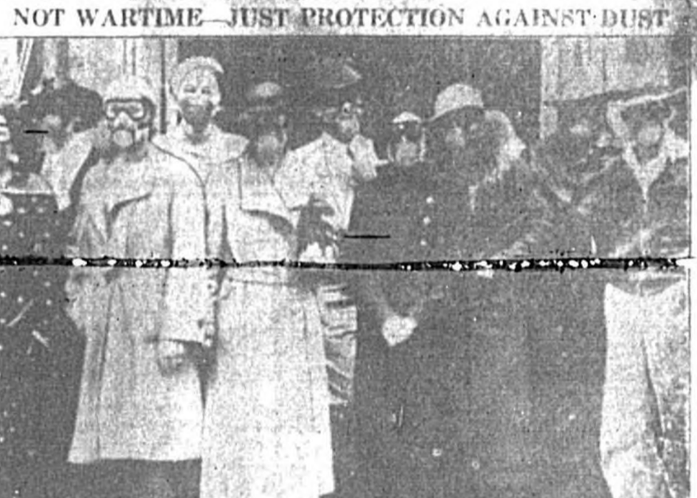
At first glance it looks as if the group were at a wartime picnic, but they are actually just a family enjoying a day outdoors. The scene is a typical example of the protection against dust.