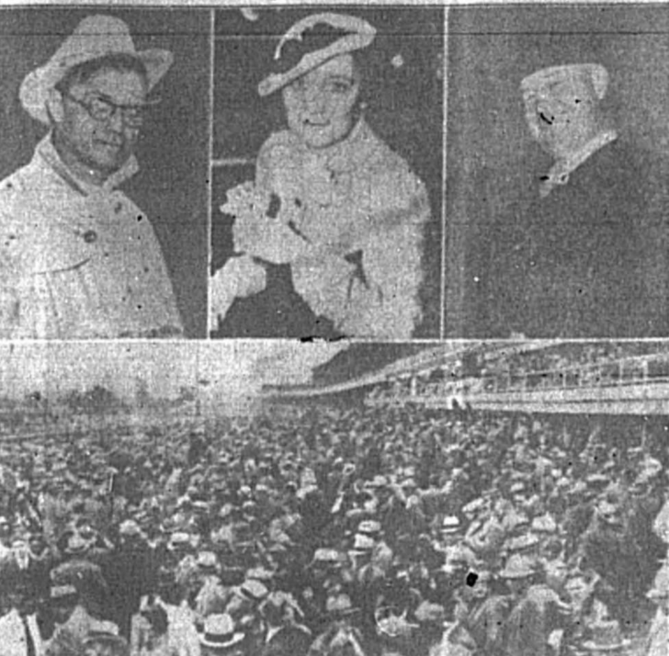
Despite intermittent showers and a high temperature, an enthusiastic crowd of nearly 10,000 saw the Kentucky Derby at Churchill Downs. The crowd was estimated to be the largest in the history of the race.