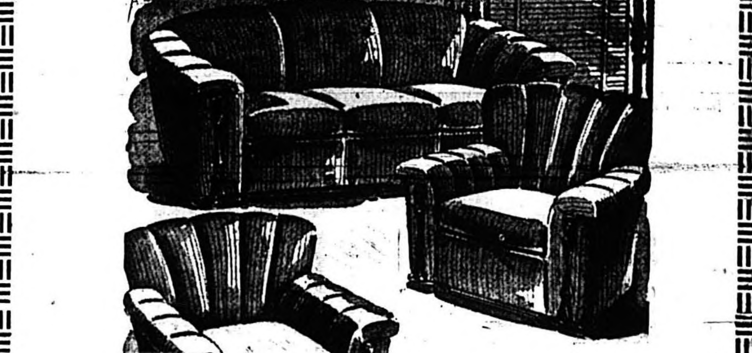
3-Piece SUITE 209.95 Easy Terms

and new furnishings will help you enjoy it more . . .