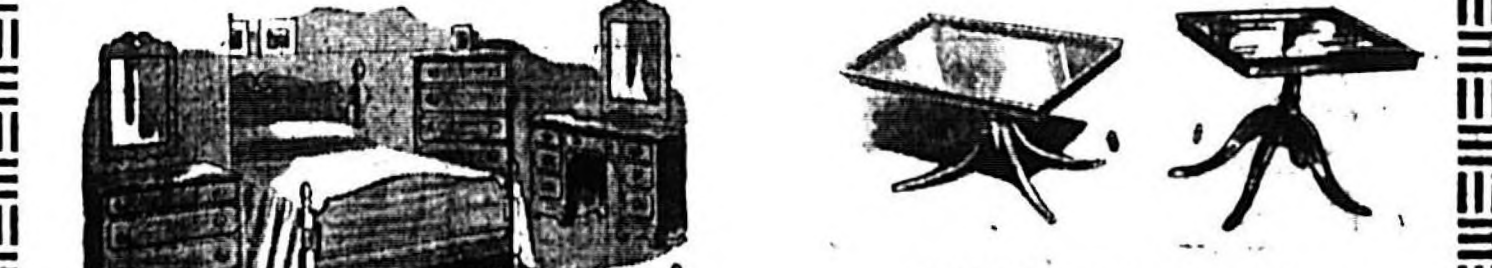
MAPLE BEDROOM SUITE Soft, mellow maple for a bedroom of charm! Choice of poster or panel bed, vanity, chest of drawers and bench. 139.50

Modern to the last detail, with deep, spring-filled balloon cushions. Rich Royal Blue Velour with walnut frame.