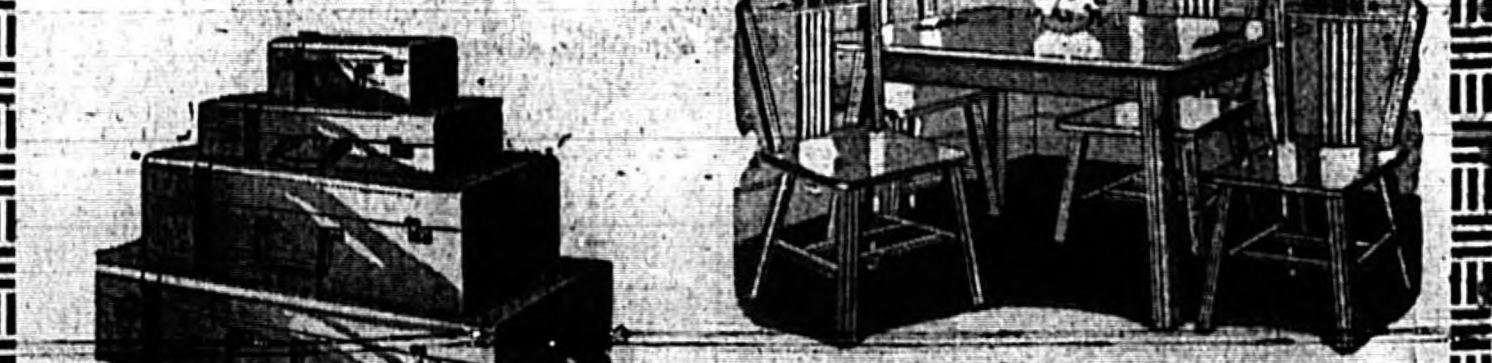
WARMTH, HOSPITALITY "AIRWAITE" LUGGAGE In singles or matched sets—durably made and nicely lined. 9.10 up (Plus Tax)

New shipment 3-cornered walnut finish whatnots — 11.95 up