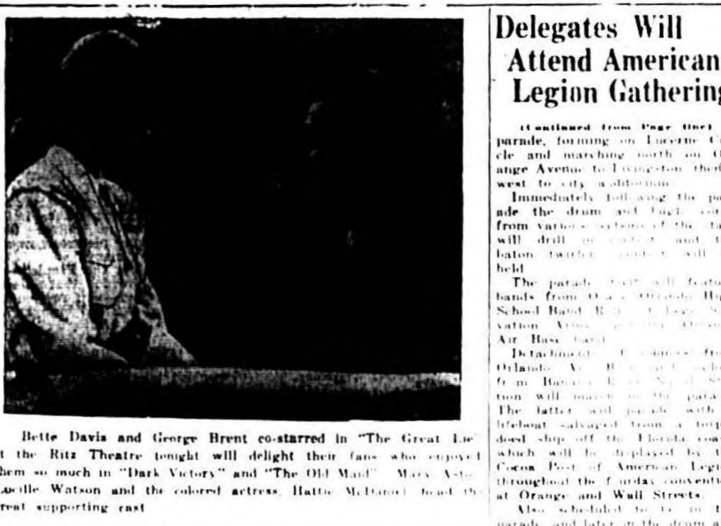
Bette Davis and George Brent co-starred in 'The Great Lie' at the Ritz Theatre tonight will delight their fans who enjoyed them so much in 'Dark Victory' and 'The Old Maid'. Mrs. Davis, Lucille Watson and the colored actress, Hattie McDaniel, head the great supporting cast.