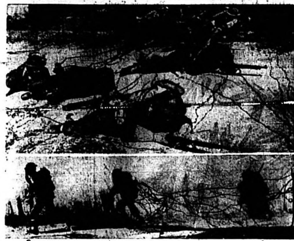
These future U. S. Army engineers, shown in training at the Engineers' Replacement Center, Fort Belvoir, Va., where they are taught how to deal with barbed wire. Top, they are shown negotiating a wire obstacle. Their hands are protected by heavy leather gloves. Below, gas-masked candidates attack through smoke screen. Training of these engineers is carried out as far as possible under conditions closely approximating actual battle.

HIRE OLDER MEN MIAMI, May 5.—(AP)—Plans for employing men between 45 and 55 years of age as substitutes for city employees entering the armed forces were advanced by Army Surgeon A. B. Curry yesterday.